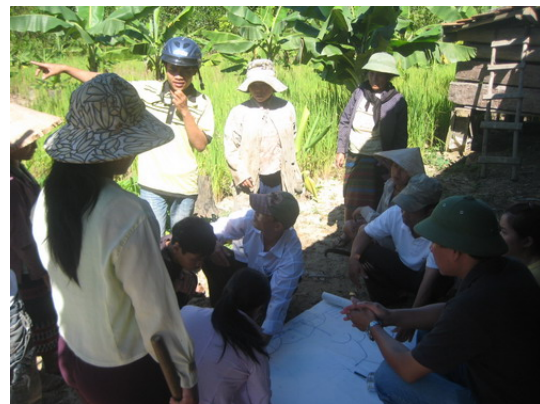
Photo 2. The local people drew co-management forest land map inside house and in the field