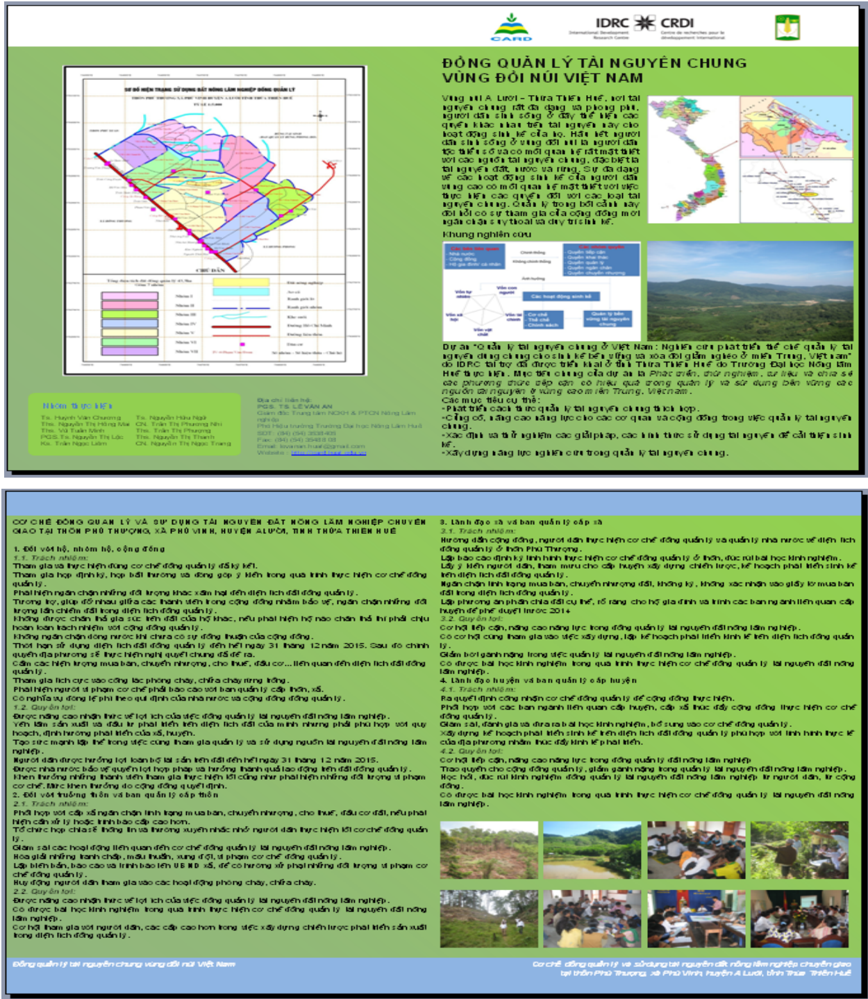
Photo 4. Area map and co-management regime will be directly given to participating local people

7 groups were established in the process of building the co-management regime on 43.5 ha of allocated forest land (Photo 4). With 34 participating households, the co-management regime based on the adjacent plots in the same hill and the unity of households' partnership.