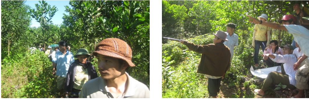
Photo 3. Local people themselves identified their boundaries and boundaries of neighbors to participate in the co-management regime