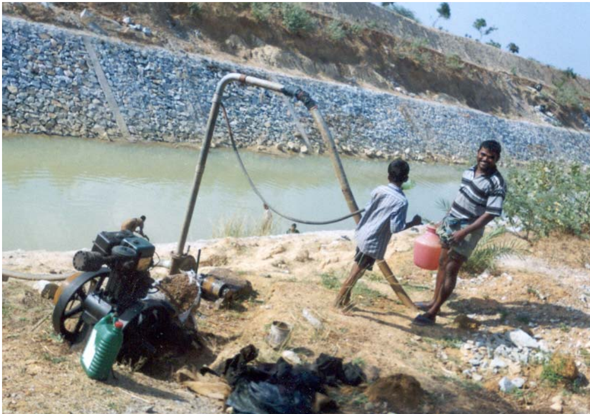
Picture: Diesel run water pump on the canal site taken on April 17th,2004. The farmer is trying to save rabi crop

Yanadivettu farmers are also happy since the excavation of 2L major on 9 th branch canal was progressing. The proposed length of the major was 11 kilometres with an estimated ayacut of 3008 acres of irrigated dry crop. But farmers were not very sure when the excavation will be complete. If it completed they can bring another 50 acres belong to the villagers in to irrigated dry agriculture. The case suggests the local farmers plan and their perceptions about the Teluguganga canal as a source of irrigation for their fields. The case also suggests with the completion of excavation of branch canals, major and minor canals in this area demands for irrigation water will increase many folds. As of today it was observed that the farmers next to the canals are irrigated their lands with siphoning or through diesel run water pumping machines. The practice of water pumping has been legitimised with the consent from local political leaders. These practices bound to continue even in future. In this case, the total available water in TGP should increase in order to ensure (some quantum of) water supply to Chennai.