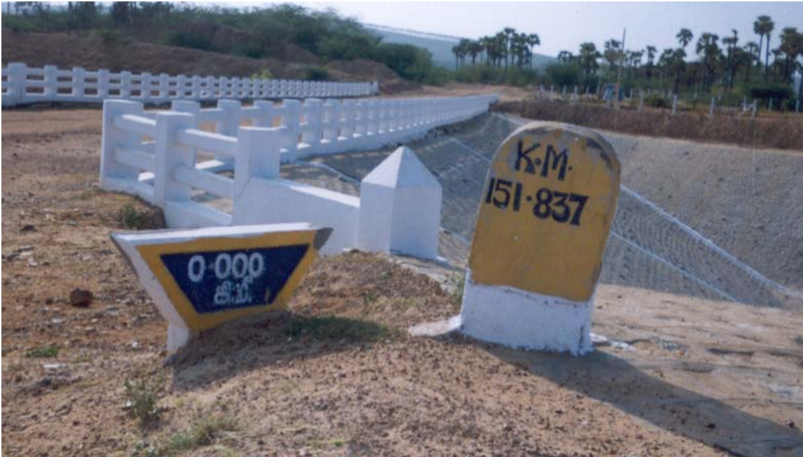
Picture No 1: The sign post of struggle : The milestones showing Andhra Pradesh boarder (151.837 km) and Tamil Nadu (0.00km)

irrigation projects. Out of the three projects work on Telugu Ganga project has been progressing. The drinking water component of this project has been completed, the work on the irrigation component of the project is slow owing to financial constraints. The local farmers are unhappy about the situation especially when they see water flowing to Chennai what ever little amount it could be.