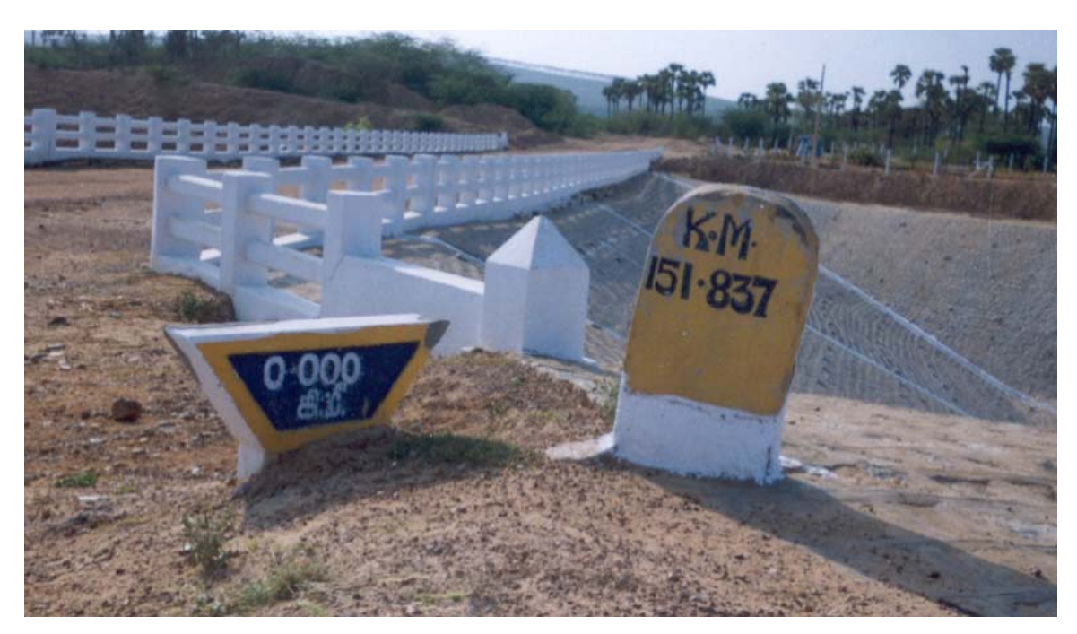
Picture No 1: The sign post of struggle : The milestones showing Andhra Pradesh boarder (151.837 km) and Tamil Nadu (0.00km)

irrigation projects. Out of the three projects work on Telugu Ganga project has been progressing. The drinking water component of this project als been completed, the work on the irrigation component of the project is slow owning to financial constraints. The local farmers are unhappy about the situation especially when they see water flowing to Chennai what ever little amount it could be.