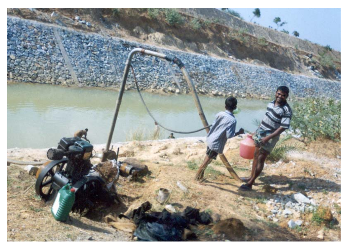
Picture: Diesel run water pump on the canal site taken on April 17th,2004. The farmer is trying to save rabi crop

Yanadivettu farmers are also happy since the excavation of 2L major on 9<sup>th</sup> branch canal was progressing. The proposed length of the major was 11 kilometres with an estimated ayacut of 3008 acres of irrigated dry crop. But farmers were not very sure when the excavation will be complete. If it completed they can bring another 50 acres belong to the villagers in to irrigated dry agriculture. The case suggests the local farmers plan and their perceptions about the Teluguganga canal as a source of irrigation for their fields. The case also suggests with the completion of excavation of branch canals, major and minor canals in this area demands for irrigation water will increase many folds. As of today it was observed that the farmers next to the canals are irrigated their lands with siphoning or through diesel run water pumping machines. The practice of water pumping has been legitimised with the consent from local political leaders. These practices bound to continue even in future. In this case, the total available water in TGP should increase in order to ensure (some quantum of) water supply to Chennai.