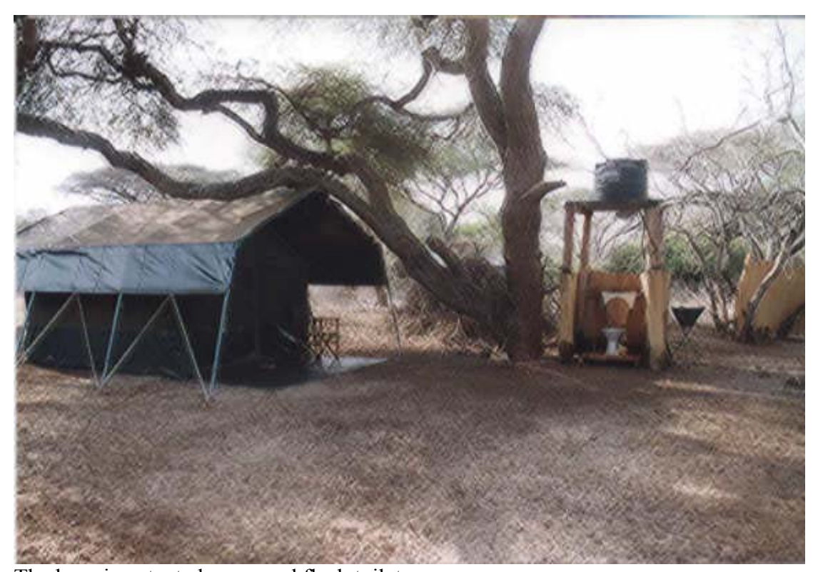
The luxurious tented camp and flush toilet

As a result of the burning incident quarrels among the Maasai group ranch members increased. The Group Ranch Committee was accused of not informing and consulting all Selengei members. The person holding the position of the Porini liaison officer was particularly contested. Tropical Places was requested to replace him. Clan politics in combination with national politics played a crucial role in this strategy. The local Member of Parliament, belonging to the opposition party Democratic Party of Kenya, was invited to reconcile and explain that land would remain in the hands of the Maasai.