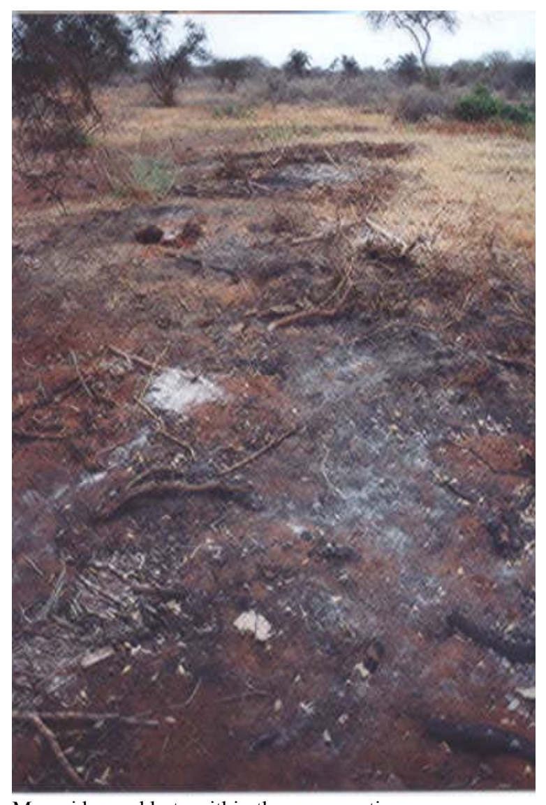
Maasai burned huts within the conservation area

character who often expressed his dislike of the Maasai and their cattle. He was once heard to have said "I do not like cattle in the conservation area – actually I hate cattle". He chased away the Maasai and warned them to stay out. Complaints and anger among the Maasai rose. The central issue in the quarrel over the use of the dry season grazing cum conservation area was the fact that the Group Ranch Committee, without consulting all the members of the group ranch, had granted permission to Porini to subdivide the 16 hectares thought to be used for the building of the lodge in four pieces of 10 acres each. The tour operator thereupon chose to develop the four corners of the Conservation Area. Selengei members not aware of this arrangement and not knowing they were prohibited from building temporary shelters had constructed huts during the very dry period of early 1999. The project manager became outraged and set fire to these huts. The Maasai in turn became furious and some warriors, mobilised by the Conservation Committee, invaded the sanctuary and threatened to set fire on the manager's camp in retaliation. They did not implement this threat but insisted the manager had to leave the area. They stated that the burning of huts was to be expected from somebody who hated cattle. After the manager was chased they also removed the Conservation Area signboard at the northwest side of the sanctuary.