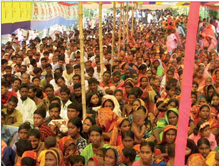
Women and men of fishing communities protesting against the shrimp industry in Bangladesh. Many believe that aquaculture and shrimp farms have ruined their lives