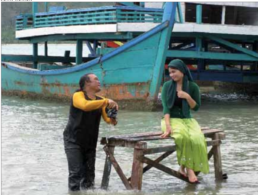
A love song sequence from the Indonesian film, Peujroh Laot . The film depicts the role and significance of the Panglima Laot in the fishery, and the legal and cultural landscape of Aceh