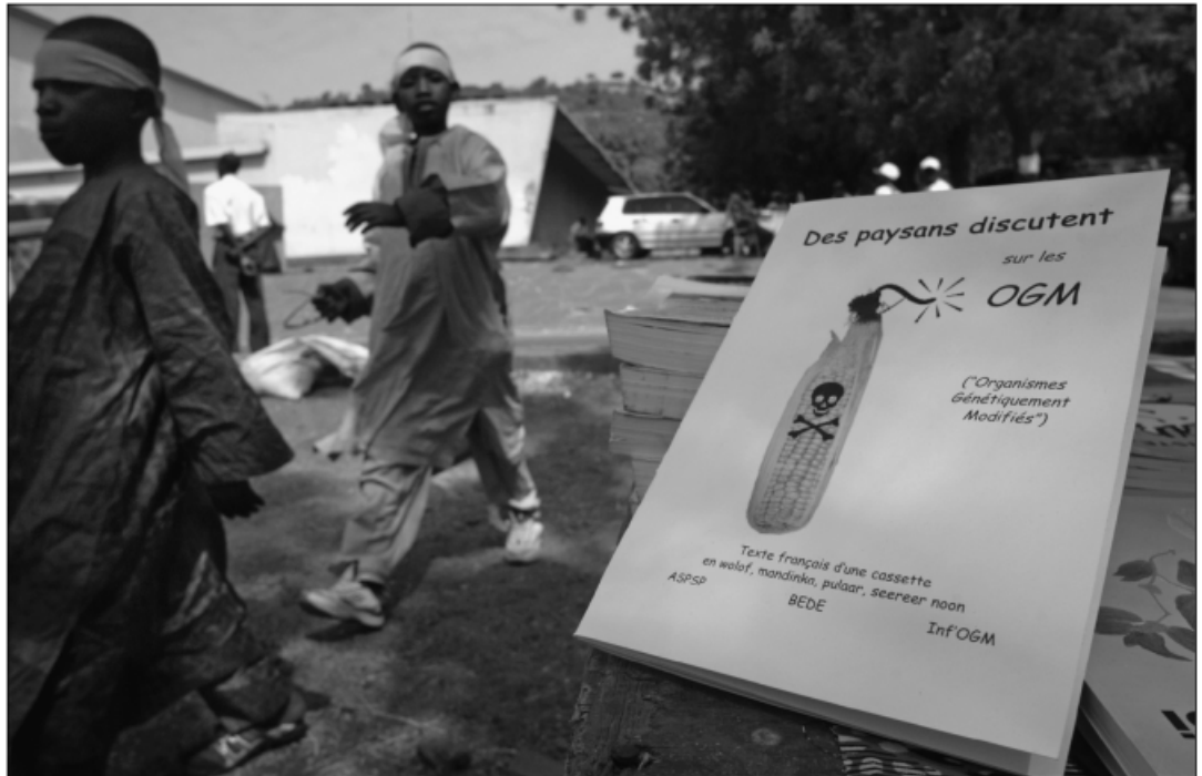
Children pass by a stall with booklets about generally modified organisms at the World Social Forum held in Bamako in January 2006.

Facilities store artifacts and make them available. Traditional facilities have been libraries and archives containing books, journals, papers, and other knowledge artifacts. These facilities had physical limits. The physical network infrastructure includes the optical fibre, copper wire switches, routers, host computers, and end-user workstations (Bernbom 2000). It also includes the amount of bandwidth, free space optics, and wireless systems. The new technologies that have made electronic, distributed information possible are also a part of the evolving physical conditions of the knowledge commons.