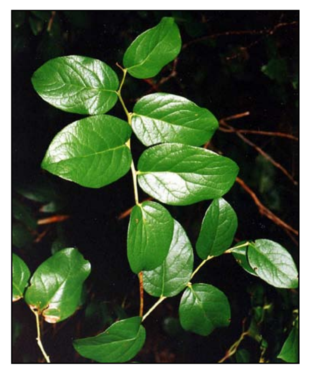
FIGURE 2. Salal (Gaultheria shallon).