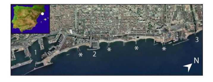
Fig. 1 . Coastline of Barcelona, indicating beaches, industrial harbors (1), recreational harbors (2), combined sewer overflow outlets (*), and the mouth of the River Besòs (3).

Maritime trade has been always important to the city, so the necessity of having a safe harbor has been one of the most pressing forces in changing the littoral profile of the city. Barcelona's coastline can be considered altered or artificial since the beginning of the 15<sup>th</sup> century when the first transformations were made to enhance the protection of trade ships. The construction of dykes and breakwaters led to corresponding changes in sedimentary flows and the reclamation of almost 400 m of land from the sea. However, throughout the following centuries, the city has modified its relationship with the sea, and different ecosystem services have been prioritized (Novoa and Alemany 2005).