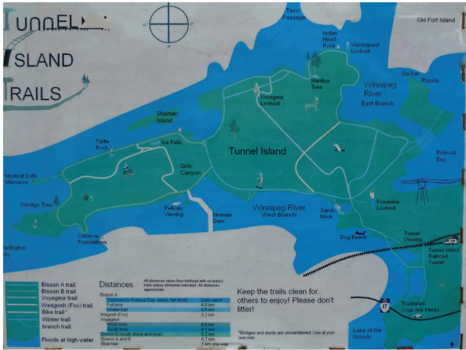
Plate 1: Trail network with ‘invented’ place names and sites of interest.

to interpret them in a particular way. The ‘Manitou (Spirit) Tree’, for example, is used by a group of women, the ‘Wednesday Girls Club’, as a site of memorial for a member who passed away.