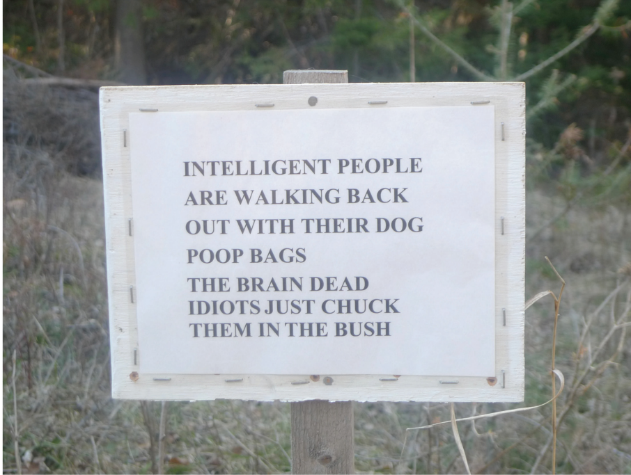
Plate 2: Tunnel Island commoner sends provocative message to fellow users.

sentiment was supported by the finding that a clear majority (61.90%) hoped that future (formal) management allowed things to “ remain as they are ”. In contrast, only 15.87% wanted more formalised management, with 22.22% sat somewhere between these two camps.