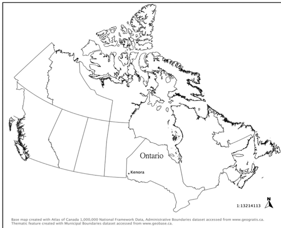
Map 1: Kenora, northwestern Ontario, Canada.

For local Ojibway, Tunnel Island (hereon referred to as TI) holds long-standing cultural and economic significance (Ratuski 2014) and continues to play