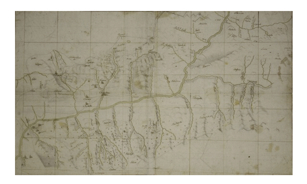
Figure 2: The Fiemme valley in the 18th century.

imposed were not exercised individually by all members of the community, but were instead assigned to heads of families. Each pater familias could participate and vote in the village assembly in which the official in charge of local administration was appointed and competed for these elective positions. In these same assemblies the management of the common lands belonging to every single village community ( Regola ) was regulated. Regole autonomously owned only a small part of the common lands. Instead, Magnifica Comunità di Fiemme directly owned the majority of the common land. The Regole were grouped into four districts that divided, by rotation ( rotolo ), various portions of the common heritage – initially on a yearly basis and, starting from 1634, every 4 years. At the end of a long phase of settlement reconfiguration, the four districts were divided in this way: 1st district included the Regole of Cavalese and Varena; the 2nd Tesero and Panchià; the 3rd Moena, Predazzo and Daiano; the 4th Castello Trodena e Carano (Bonazza 2009).