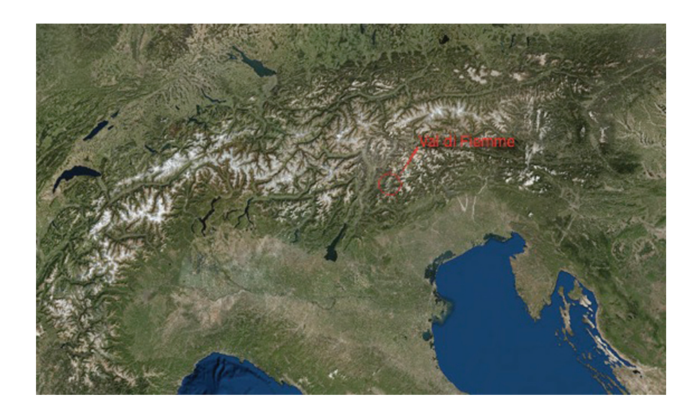
Figure 1: Location of Fiemme valley.

soils at the valley bottom were used for cereal production; among them corn, which spread to Trentino in the first half of the seventeenth century, and was predominant in Fiemme and in the rest of the region. Barley, wheat and oats were also widespread. The earliest sources indicate that potato cultivation started towards the end of 1700, but already in the first decades of the next century (especially after the famine of 1816–1817) did it become a staple in Fiemme inhabitants' diets. On the whole, agricultural production, especially cereal, was not sufficient to meet the needs of the population. The constant grain deficit was partially balanced by the widespread seasonal migration and above all, from the exploitation of massive collective properties.<sup>4</sup>