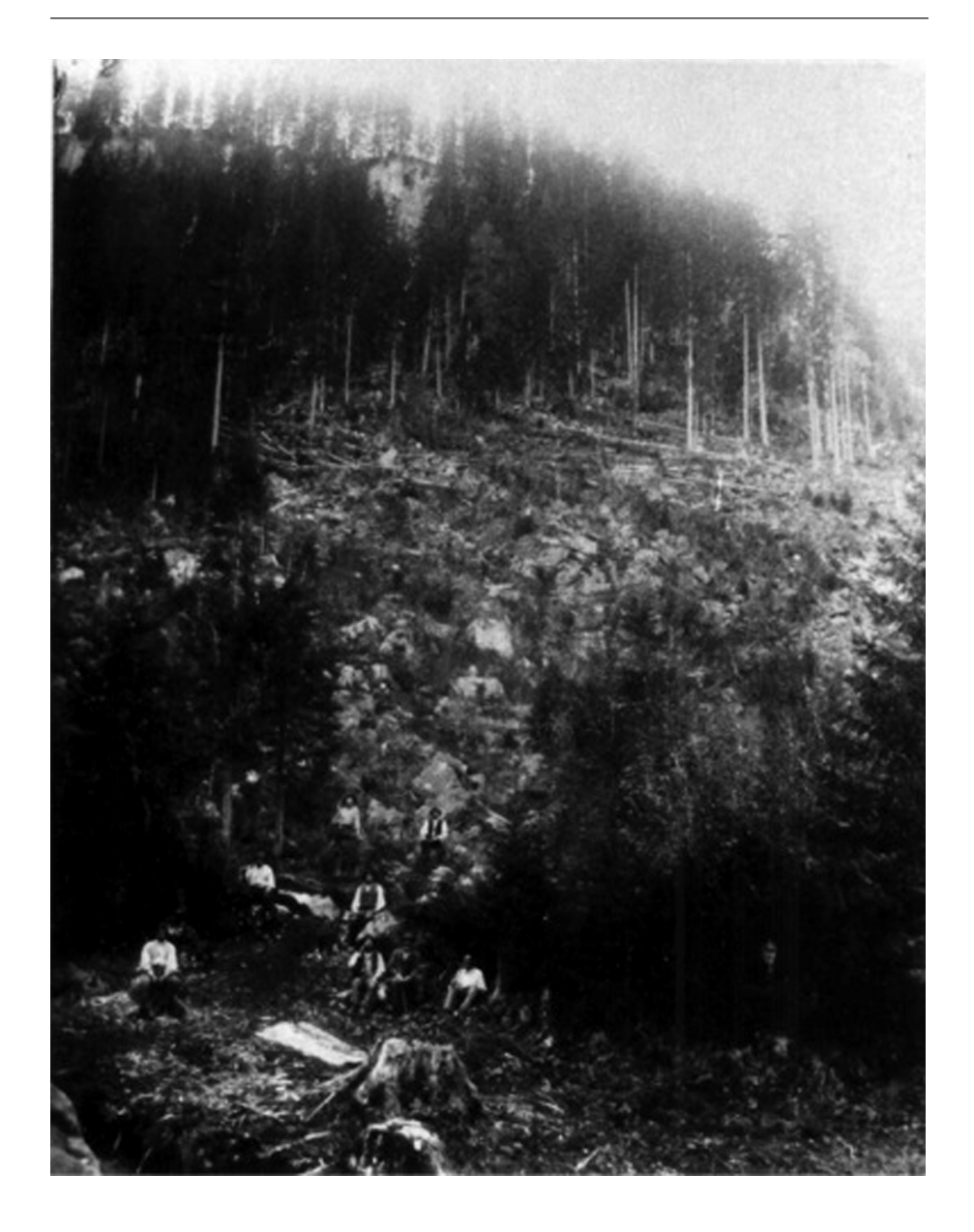
Figure 4: Forest workers (end of the nineteenth century).

appropriate to speak of a series of factors that have varied over time. Concerning the period analysed, two questions can be addressed: what has enabled the Community to play an active role and not be a mere spectator in the process of state centralisation, mediating constantly their rights rather than sustaining impo-