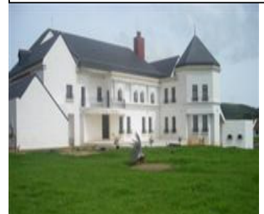
Baba's vila in Elba Ranch