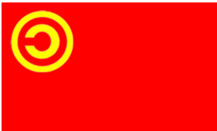
Figure 1: Copyleft flag posted on Boing!Boing! .

But on Slashdot, the online community of programmers where the real social roots of the free/open source software movement lie, people reacted in a less calculated and more revealing way.