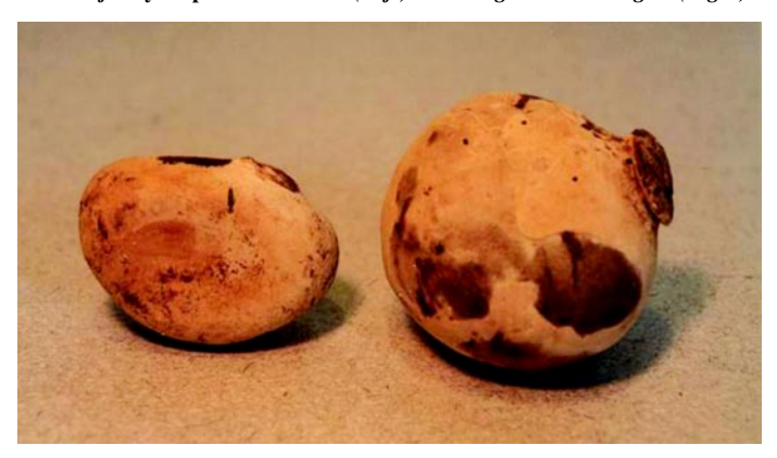
Note: Photo by J. Tuxill