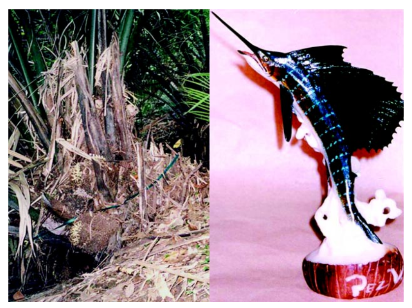
Note: Carving by Saludo Membora from 1997.