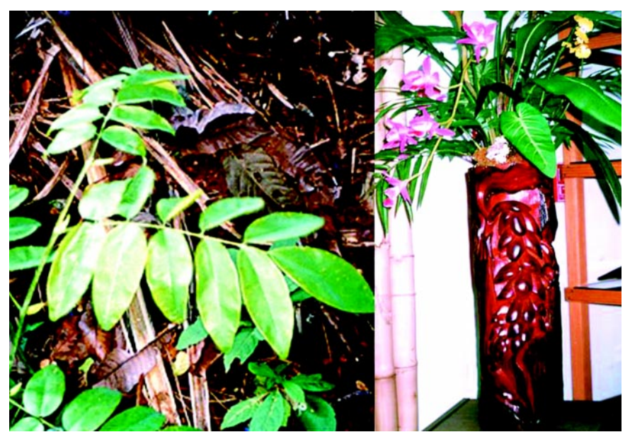
Note: Artisan unknown, 1997 carving courtesy of Tropical Illusions.

results (Table 2) indicated more cocobolo artisans in the towns of La Chunga and Mogue than in Puerto Lara, which may reflect a longer history of commercial carving among Emberá or an effect of resource scarcity in Puerto Lara, or both. Travel time to harvest cocobolo averaged five hours from Puerto Lara, and all carvers here purchased cocobolo.