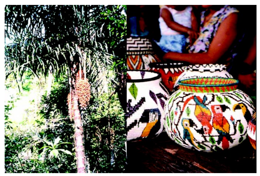
Figure 5 Chunga Palm, Astrocarym standleyanum (Left) and Baskets of Chunga Fibers Circa 1998 (Right)

The palm is destructively harvested by felling, usually by men, although only the spear leaf and frequently the first expanded leaf are used. As with all harvests, Wounaan and Emberá only gather chunga with the waning moon as they believe this insures the strength of the fibres (Gallego Castillo 1995; Reichel-Dolmatoff 1960; Velásquez Runk 2001b). However, in the past several years the need for fibres has meant that Wounaan and Emberá purchase them, although do not gather them, from mestizo vendors during any phase of the moon. In our research villages chunga harvesters typically sought their own resources with the exception of Puerto Lara, where 75 per cent of weaving households purchase chunga (Table 2).