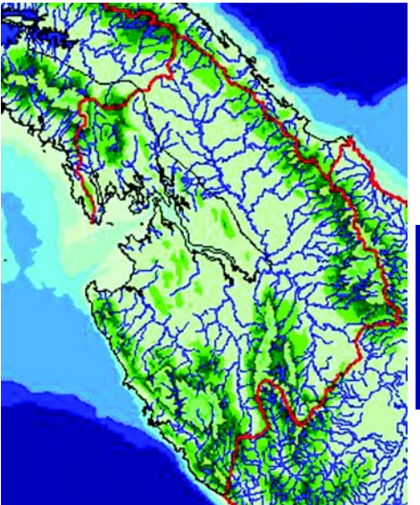
Figure 1 Eastern Panamá with Darién Province Indicated by Red Boundary Lines (Inset Map Indicates the Location of Darién within Panamá)

From January 1997 to December 2001 we studied the ecology and socio-economics of three artisanal non-timber forest products of eastern Panamá, primarily in Darién province (Figure 1). The Darién province of Panamá is considered part of the Darién/Chocó biogeographic region, which extends from eastern Panamá into northern Ecuador, and is characterised by floral and faunal assemblages of North and South American origin (Dinerstein et al. 1995; Gentry 1986; Stattersfield et al. 1998). The area is characterised by lowland tropical moist forest, and is the most extensively forested province of Panamá. Lowland eastern Panamá has a distinct dry season from December to April with annual rainfall of 2,000–2,500 mm and temperatures averaging 27°C (Instituto Geográfico Nacional Tommy Guardia 2003). In addition to sharing a similar biogeography, Panamá's Darién province and Colombia's Chocó department are also both home to Wounaan and Emberá communities.