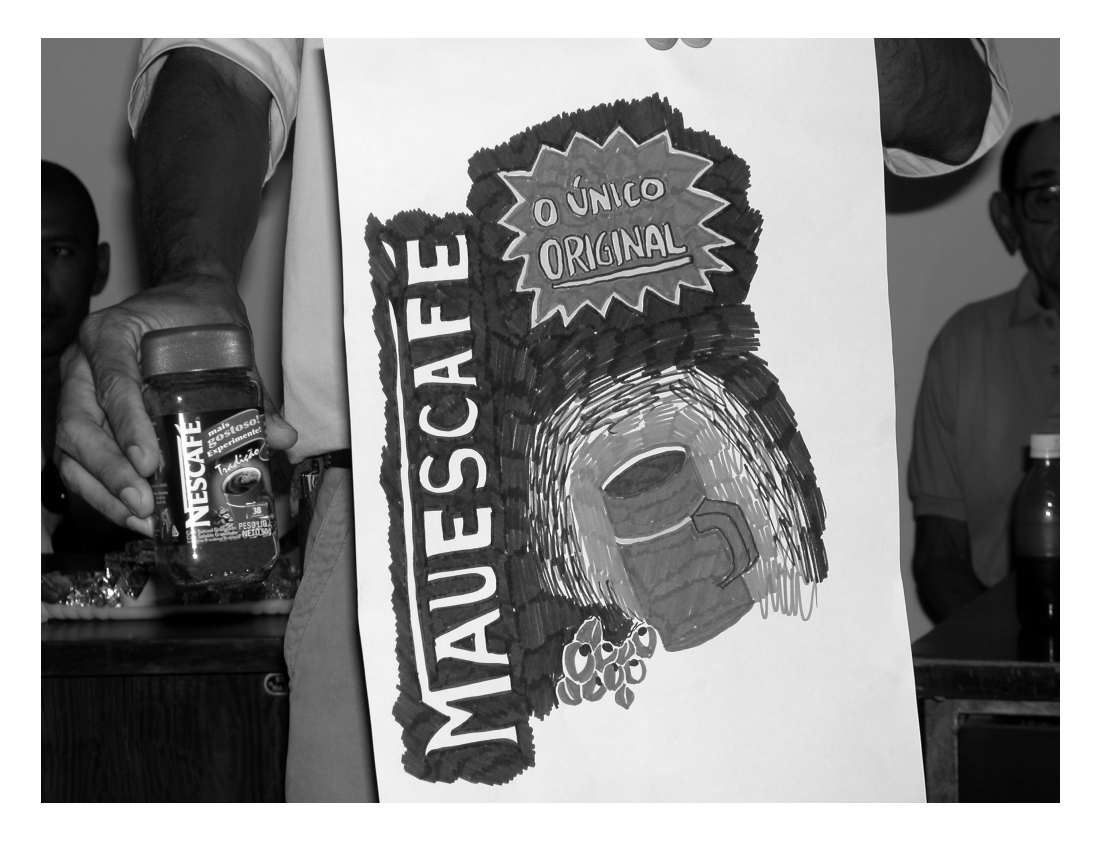
Figure 1. Maues Café

will eventually compete with the products of global multinationals. In one ongoing collaboration, Superflex works with a farmers' cooperative in Maues, Brazil. This region in the Amazon is famous for cultivating the guarana berry, prized by the local population for its perceived medicinal and energy-giving properties. The Dutch multinational Ambev and Pepsi Co. have successfully marketed global energy drinks derived from this plant, most notably Ambev's "Antarctica" drink. The local Maues farmers complained that the multinationals have formed a cartel, driving down the price of the guarana berries from $25/kilo to $4/kilo. So the cooperative is fighting back. In collaboration with Superflex, farmers held brainstorming sessions to begin developing their own product and designing a label for it. One member, for example, suggested a coffee drink called Maues Café, evoking the internationally popular Nescafé drink, as depicted in Figure 1.