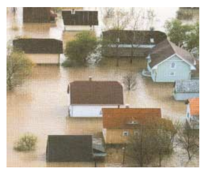
Picture 1: Flood Along the Tisza River, Hungary/Ukraine Geographers believe that a significant factor in the worsening flooding is because of tree clearing in Ukraine in the catchment area of the upper Tisza.