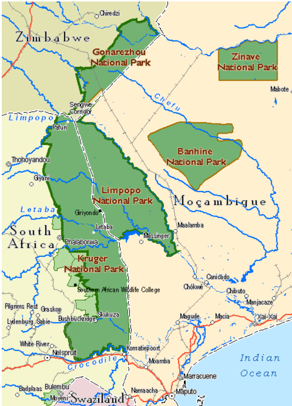
Map 1. Great Limpopo TFCA.

The land incorporated in the Great Limpopo TFCA has been the locus of drawn-out conflicts between Zimbabwe, South Africa, and Mozambique (Koch, 1998; Vines, 1991). Despite (or perhaps because of) continued violence in the borderlands, the idea of merging