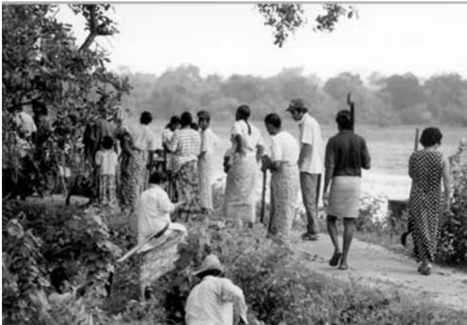
Photo 1. Removing weeds and bushes from the tank bund through shramadana.

In addition to the interviews, participatory observation and direct observation proved to be another powerful method for obtaining information. Participatory observation was realized through participation in the collection of water for domestic purposes, through shramadana (voluntary participation in collective maintenance activities [photo 1]) and through participation in a group of women at work with both harvesting paddy and transplanting onion. Furthermore, more than 20 interviews were actually carried out in the paddy fields, which facilitated close observation of all other cultivation activities.