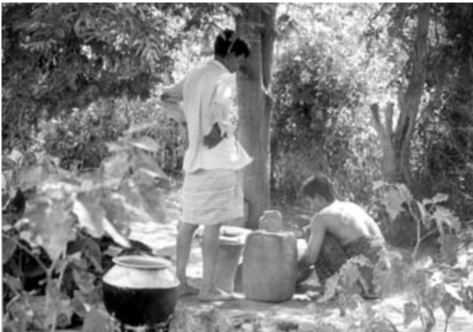
Photo 3. Men preparing milk-rice as an offering to god Pulliyar.

During the time of land preparation, one can observe many male and a few female farmers in the field constructing small field bunds, cleaning canals, and irrigating their fields. These activities are thus not restricted to the men's domain of activities. The range of productive activities, in which women are involved in their own (household) fields, is determined by the prevailing perceptions of male and female tasks, their respective skills (including the skill to operate equipment and machinery) and the required physical strength. Their perceived lack of skills to operate equipment and machinery seems to provide a clear reason for their noninvolvement in ploughing and threshing. Several male respondents referred to the "sacred" character of the threshing floor as reason, why they do not allow women on the threshing floor (photo 3).