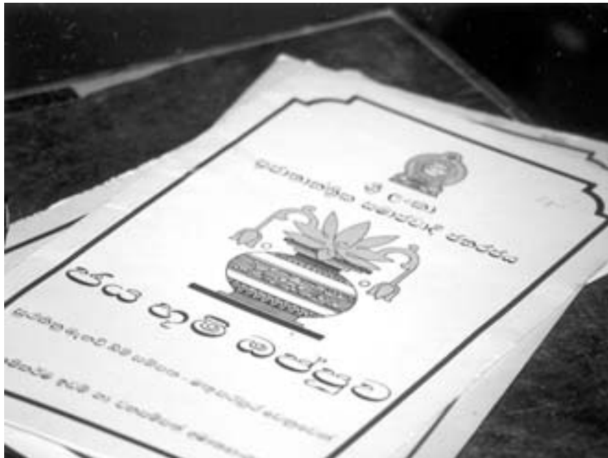
Photo 6. A Jayabhoomi deed related to landownership.