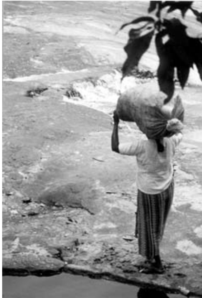
Photo 5. A woman with heavy burden.

Women who can rely on male relatives for such activities are not very eager to take over these activities, as it means strenuous labor, an extra burden (photo 5) on their workload and, as it does not match with the gender-based division of tasks. 4 For them, there is no benefit in taking over this activity from their husbands, as they are not likely to get better prices or get