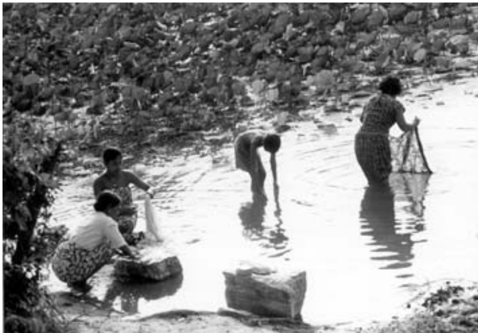
Photo 2. Women laundering at a village tank.

The North Central Province, part of the Dry Zone of Sri Lanka, is characterized by a large number of water reservoirs, also referred to as “tanks,” which have been used for centuries for irrigation and domestic purposes, and have also served as the main source for drinking water until a few decades ago. Some of these tanks can be dated back to “ancient kings’ times” (between the start of the Christian era and the twelfth century A.D.). The livelihood of farmers in this area is closely linked with the village tanks, small water reservoirs for the collection of rainwater to be used for irrigation as well as for washing (photo 2) and bathing purposes. Under these tanks, farmers preferably cultivate paddy; all land in the command areas is consequently referred to as paddy land. Rainfall is not reliable enough for regular paddy cultivation and, therefore, the population also depends on chena (shifting) cultivation of other field crops (OFCs). Chena fields are cleared by “slash-and-burn;” these areas are usually encroached lands in jungle area, which belong to the State (lands under the Crown Lands Ordinance). The area is relatively poor, due to unreliable rainfall, low cropping intensities and lack of alternative employment opportunities nearby. In times of drought, families depend on food supply and income from chena cultivation, income from day labor, earnings from their children and from grants given under Janasaviya or Samurdhi (poverty alleviation programs).