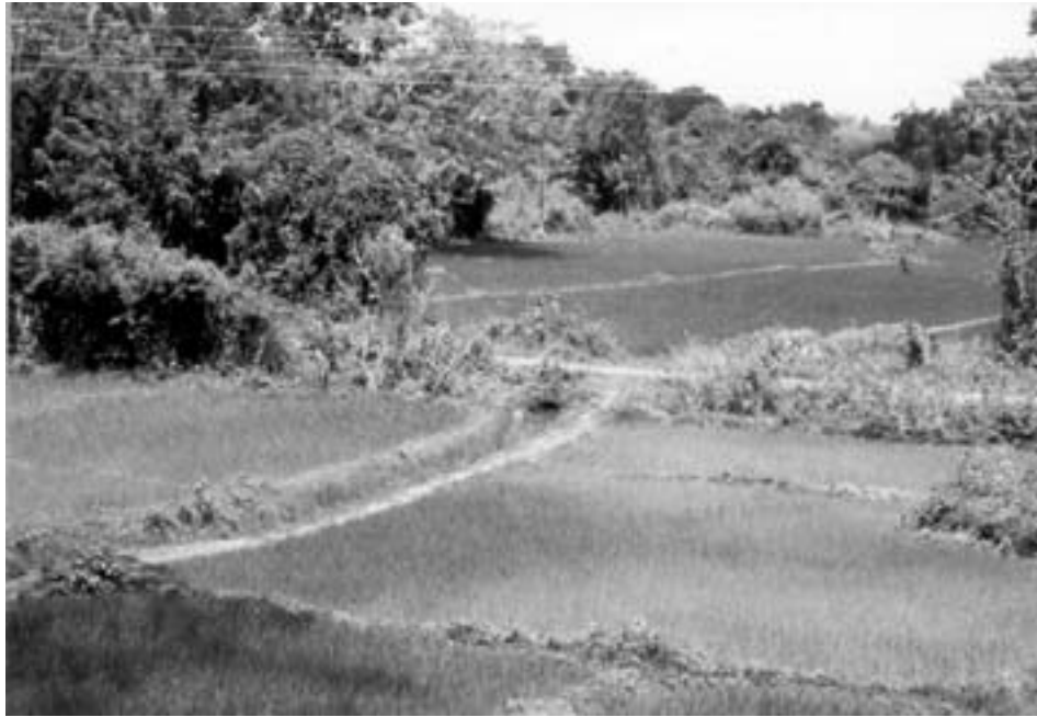
Photo 7. Paddy fields with a field channel.

Most of the FO members are landowners in the command area of the tank. Traditionally, ownership of paddy lands has been inextricably linked to FO membership or to participation in the kanna meetings. Under the current Agrarian Services Act, the criterion of ownership of paddy lands has been removed. Others may also apply for membership of the FO, provided that they cultivate land, their age is over 18 years, they reside in the FO area and they show interest in the FO activities. 14 The adjustment of the criteria for FO membership gives the FO more authority to effectuate its decisions and to exercise control among a larger group of cultivators and tenants. The owners of paddy lands in the command area of the tanks were, and still are, referred to as shareholders. The shares refer to the share of land they have in the command area of the tank. All shares are listed in a pangu (shares) list.