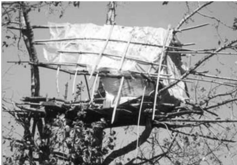
Photo 4. A watching hut. A farmer can watch the approach of wild elephants (or other wild animals) from this vantage point and frighten them away with gunshots, etc.

A large majority of the widows and divorced women ( de jure heads of household) in the case study areas earn their living by farming. Their dependency on assistance from relatives has increased considerably after the death of, or separation from, their husbands. Paddy cultivation involves activities, which cannot be performed independently by women and which are not appropriate for them to do (e.g., watching the fields at night [photo 4]). Free riding is not allowed with regard to cleaning their part of the irrigation canal, fencing, building watching huts, or in the rotational watching of the paddy fields at night. However, it is not always sanctioned. If they cannot find relatives to assist them, they are supposed to hire laborers for these activities. The transaction costs of finding assistance are likely to be highest for women who do not have close relatives in the village. The study did not reveal whether assistance from relatives is compensated for with food, services or part of the yield.