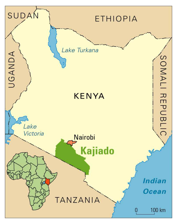
Map 1 Kajiado District, Kenya (Since 2007 split into Kajiado and Loitokitok districts)

(natural) resources into productive capital. His claim has been welcomed by national and international policy makers struggling to improve developing countries' economies over the last fifty years.