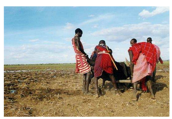
Maasai hauling a weakened cow back onto her feet

3. Grazing scheme experiments: 1945-1963 After 1947, three grazing schemes were established with funds released through the African Land Development Programme. The idea of communal land ownership was unofficially dropped as early as 1950 by the Department of Agriculture.