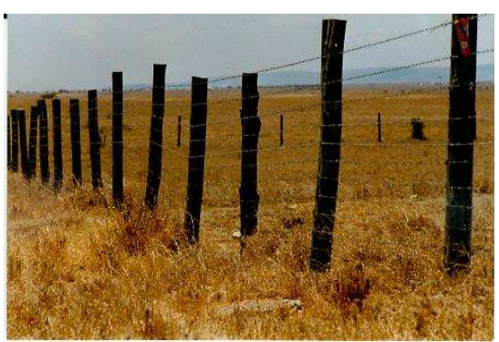
Fences in Maasailand