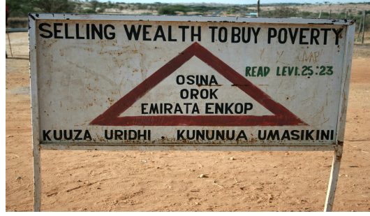
Billboards warning Maasai not to sell their land

Corrupt practices in formal land registration do not help to build confidence in the formal landtenure system and a natural non-equilibrium environment makes economic activities such as livestock keeping risky and can guickly result in loan arrears. The failure of World Bank managers to run profitable businesses on Maasai ranches in the 1960s and 1970s is proof that formal property rights do not work well in semi-arid areas. As long as these risks create an uncertain business climate that undermines investments, the introduction of formal property rights will not be able to act as a panacea for wealth creation in these regions. On the contrary, the evidence presented here shows that the opposite, i.e. a loss of wealth, is more likely. For now, besides educating Maasai landowners about the value of land, the best the Maasai youngsters can hope for is that their parents will value the wealth they still own. As for De Soto's claim that formalized property rights will do the trick, let us hope that Kenya's experience is an exception to the rule.