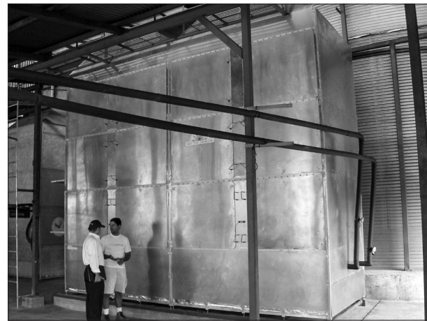
Figure 1: Industrial solar coffee dryers installed at the Montes de Oro Cooperative, Mirimar, Costa Rica. Each tower contains rotating trays on which coffee is placed for drying. Heat for drying is derived from exterior-mounted solar hot-water collectors as also for the gasification of coffee parchment

Energy conservation will be further realized at Montes de Oro through the practise of co-generation, using waste products from coffee production to produce electricity through a thermo-chemical gasification process that is currently operational at Montes de Oro. This co-generation will be able to produce 15 kWh of electric power, more than sufficient to supply the 2 kWh required for the solar/biomass dryer. For gasification, coffee parchment is collected and gasified by a thermo-chemical reaction called pyrolysis, in which the carbohydrates of the parchment are broken down to their fundamental molecular components. A gaseous mixture of hydrogen, carbon monoxide and oxygen are the main components of the so-called producer gas, which is a fuel that burns similar to natural gas or propane, although with a lower energy content. With this