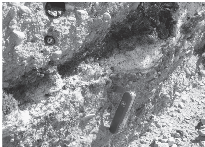
Soil section along the Aishihik Road, showing a layer of White River Ash (just above knife) covered by soil.

This research will use ostracodes and chironomids, two widely used biological proxies, to reconstruct environmental change (Griffiths and Holmes, 2000; Porinchi and MacDonald, 2003). Ostracodes are small, bivalved crustaceans with a shell that preserves well in lake sediments. Chironomids are the larval stage of non-biting midges, the head capsule of which is made of chitin and is also well preserved in lake sediments. Both of these organisms live at the sediment-water interface, consume organic detritus, and have parts that fossilize and can be identified to genus, or in many instances, to species. The ecological requirements of individual species are then used to infer the type