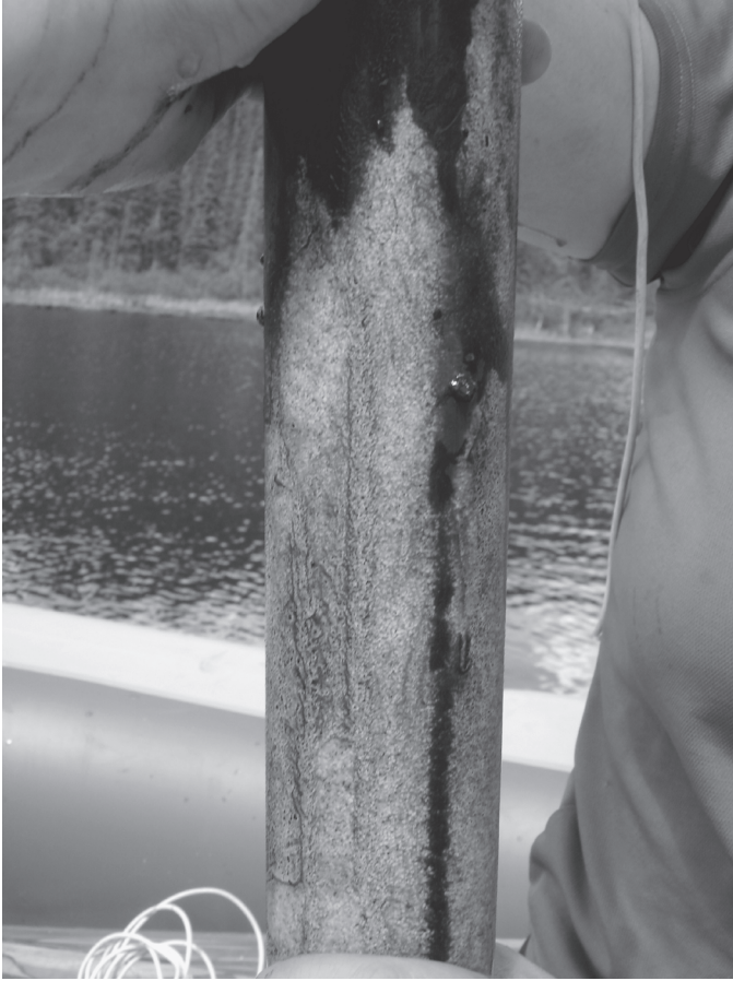
White River Ash in a lake sediment core from Donjek Kettle.

the past 2000 years in the southwest Yukon; and 3) more generally, to infer whether aquatic ecosystems in the southwest Yukon respond in a similar manner to different environmental stressors, particularly the impact of the White River Ash event and climate change.