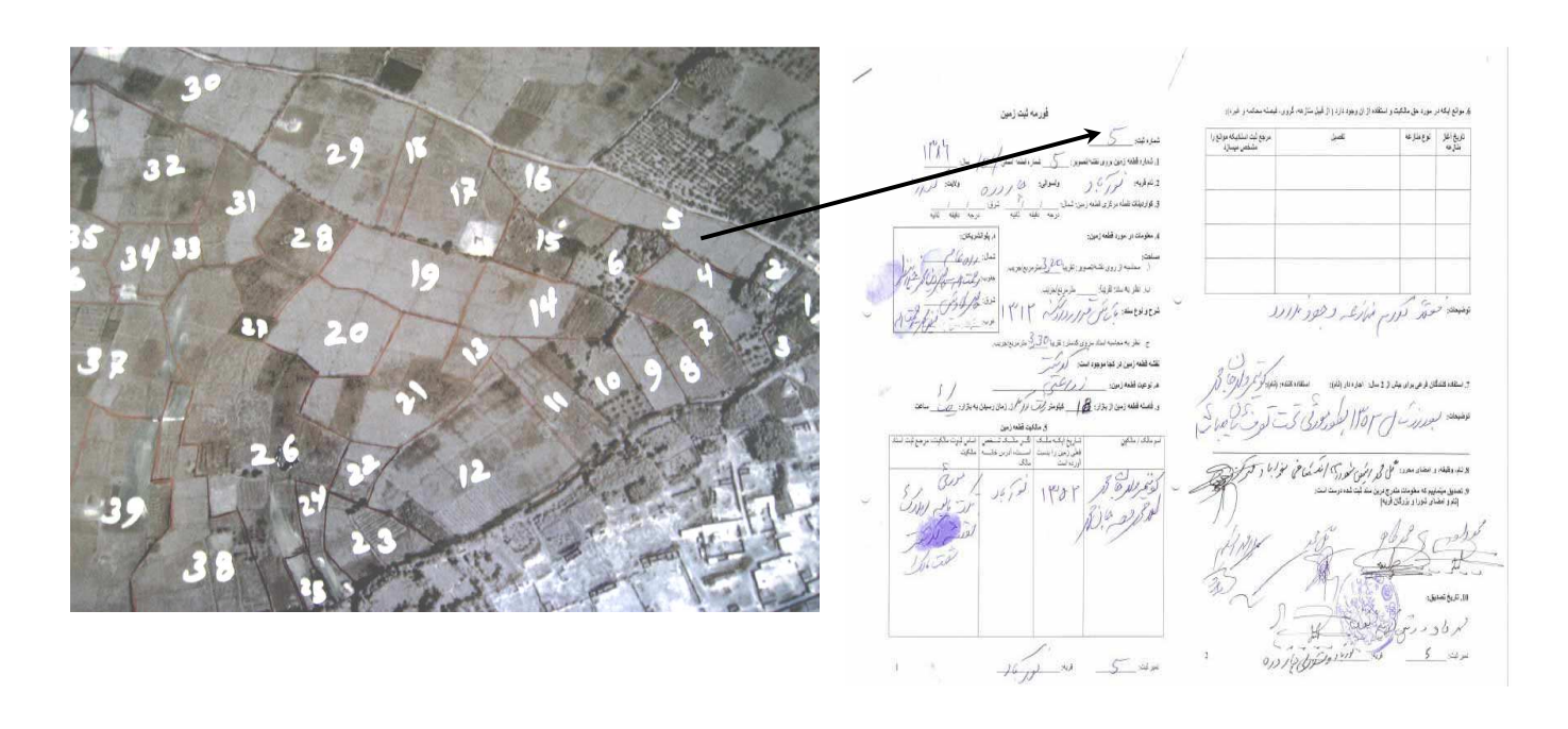
Figure 3: The village-based parcel register for private agricultural land

However, due to the limited testing of methodologies for cropland during the pilots, any extension of the approach will require additional piloting to develop further amended methodologies suitable for ownership of croplands. This includes the role of 'Village Recording Secretaries' designated by the community council, who shall be responsible for the management and archiving of delineated satellite images and parcel forms and who need training in the procedures for maintaining and updating cropland ownership records and maps. Also, questions pertaining to the amount of review needed of the field teams' work on boundary delineation and parcel register forms and how to control unauthorized changing of parcel records need to be addressed further. Finally, ownership and boundaries of state-owned cropland parcels needs to be done unanimously to assure proper recording.