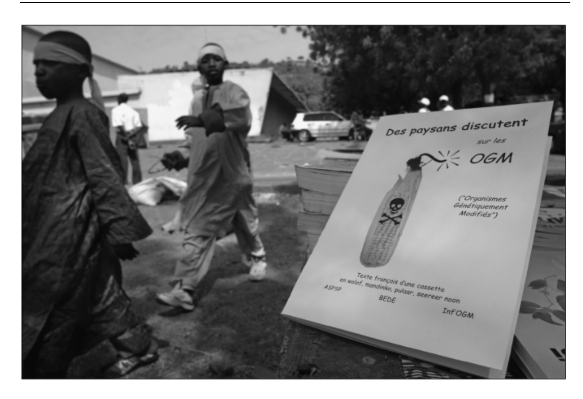
Children pass by a stall with booklets about generally modified organisms at the World Social Forum held in Bamako in January 2006.

Facilities store artifacts and make them available. Traditional facilities have been libraries and archives containing books, journals, papers, and other knowledge artifacts. These facilities had physical limits. The physical network infrastructure includes the optical fibre, copper wire switches, routers, host computers, and end-user workstations (Bernbom 2000). It also includes the amount of bandwidth, free space optics, and wireless systems. The new technologies that have made electronic, distributed information possible are also a part of the evolving physical conditions of the knowledge commons.