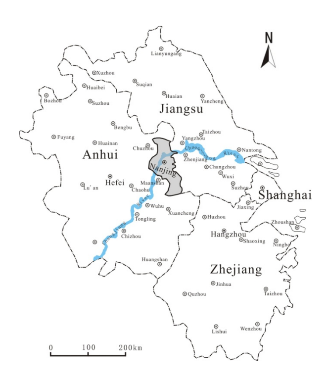
Figure 1. The Map of the Cities Encompassing the Yangtze River Delta Note: the city of Nanjing is bolded in gray