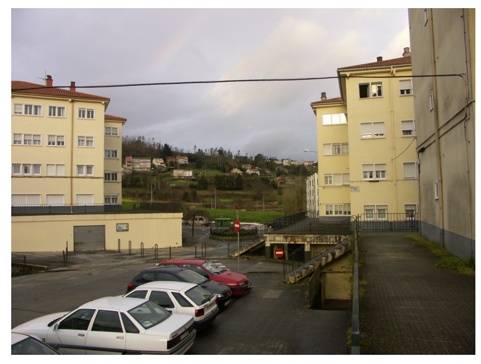
Fig. (4). The Vista Alegre District before the Implementation of the ARIs.

of public transport and the creation of networks of pedestrian itineraries, connecting the main points generating and attracting mobility in the city.