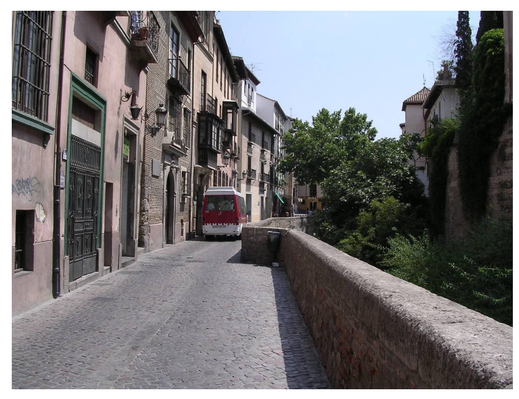
Fig. (2). Mini bus passing through the Ribera del Darro (Granada).

measures to rearrange urban mobility were adopted, buses went into the historic centre and created serious conflicts with local road traffic and pedestrians. The situation was always worsened by the topographical location of the city itself, which developed into an increasingly unsustainable vicious circle.