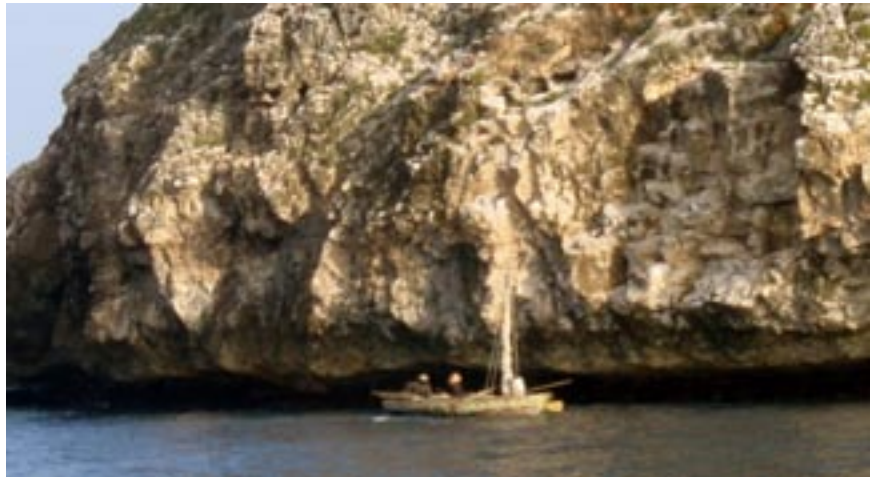
Figure 3.—Single sail-powered boat observed.

the mooring site at Lulu Bay (Table 1, Fig. 6–9). The dominant species observed in the catch were queen conch, ocean triggerfish, schoolmaster snapper, and bar jacks. Other common taxa included juvenile hawksbill turtles, spiny lobster, yellow stingrays, squirrelfish, surgeonfish, trunkfish, barracudas, and black durgons (see Table 1 for scientific names). Some snapper and red hind were observed, but most were smaller than 30 cm and many were less than 20 cm. Only one parrotfish was observed.