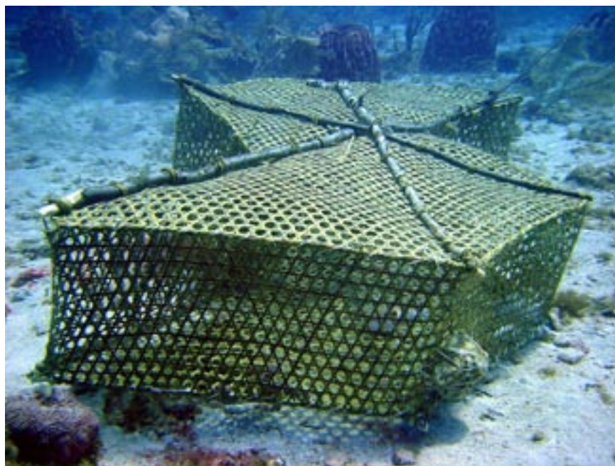
Figure 5.—Typical Antillean Z-trap used at Navassa Island.