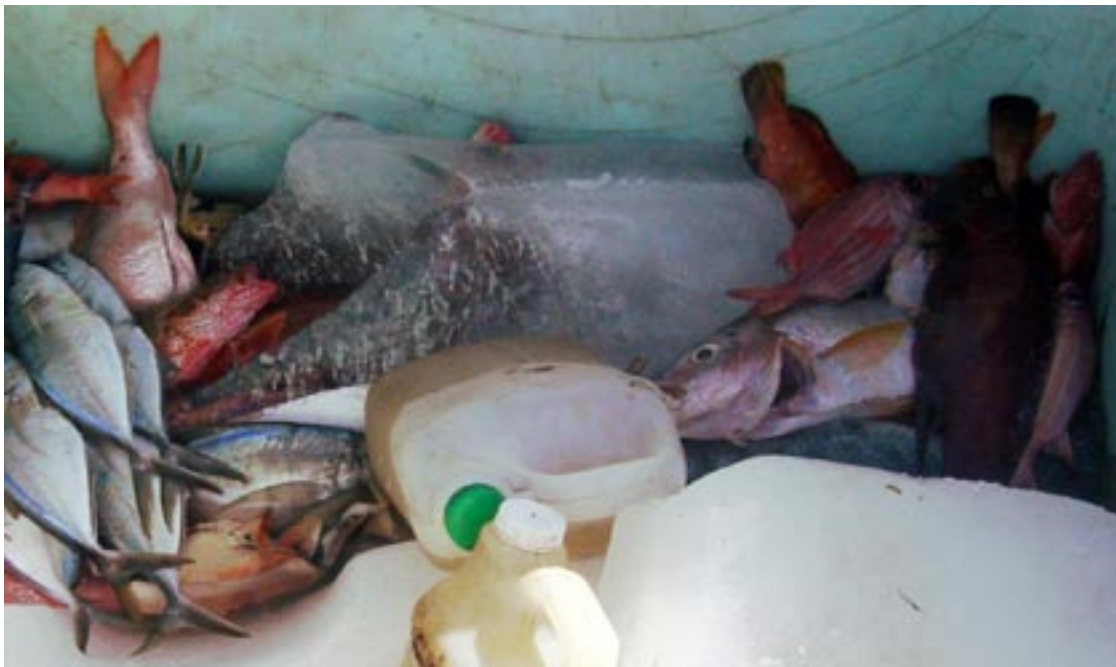
Figure 6.—Miscellaneous finfish catch from hook and line in the only ice chest observed.

hauled to the surface (i.e. trammel netting). While it is not certain if harvest of queen conch and sea turtles was intended by the adoption of net fishing, the quantity of conch caught and this seeming need for such specialized net usage to procure conch suggest that they are specifically targeted by the Haitian fisherman. Similarly, the ratio of our observations of live and caught sea turtles (10:8 in 300 dives versus 3 boat interviews) suggests that sea turtles are targeted to some extent, possibly by deploying nets around a turtle after it is observed surfacing.