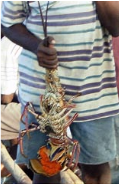
Figure 7.—Large gravid lobster.