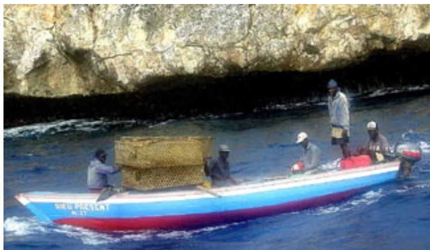
Figure 4.—Typical Haitian fishing vessel with 10–15 hp motor.