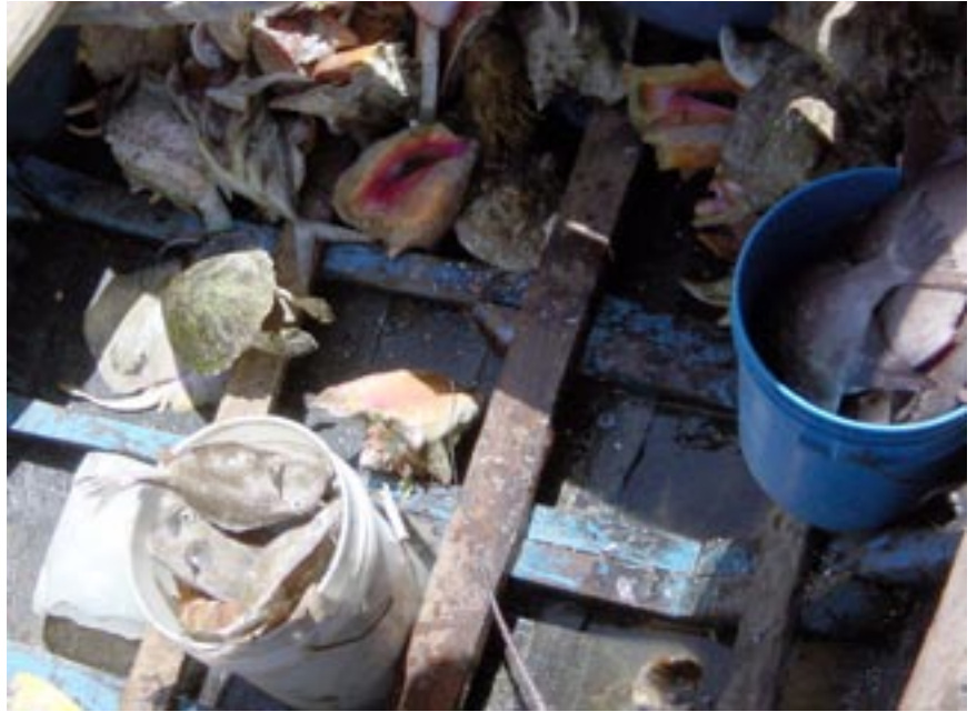
Figure 8.—Mixed catch including small hawksbill turtle, queen conch, and finfish.