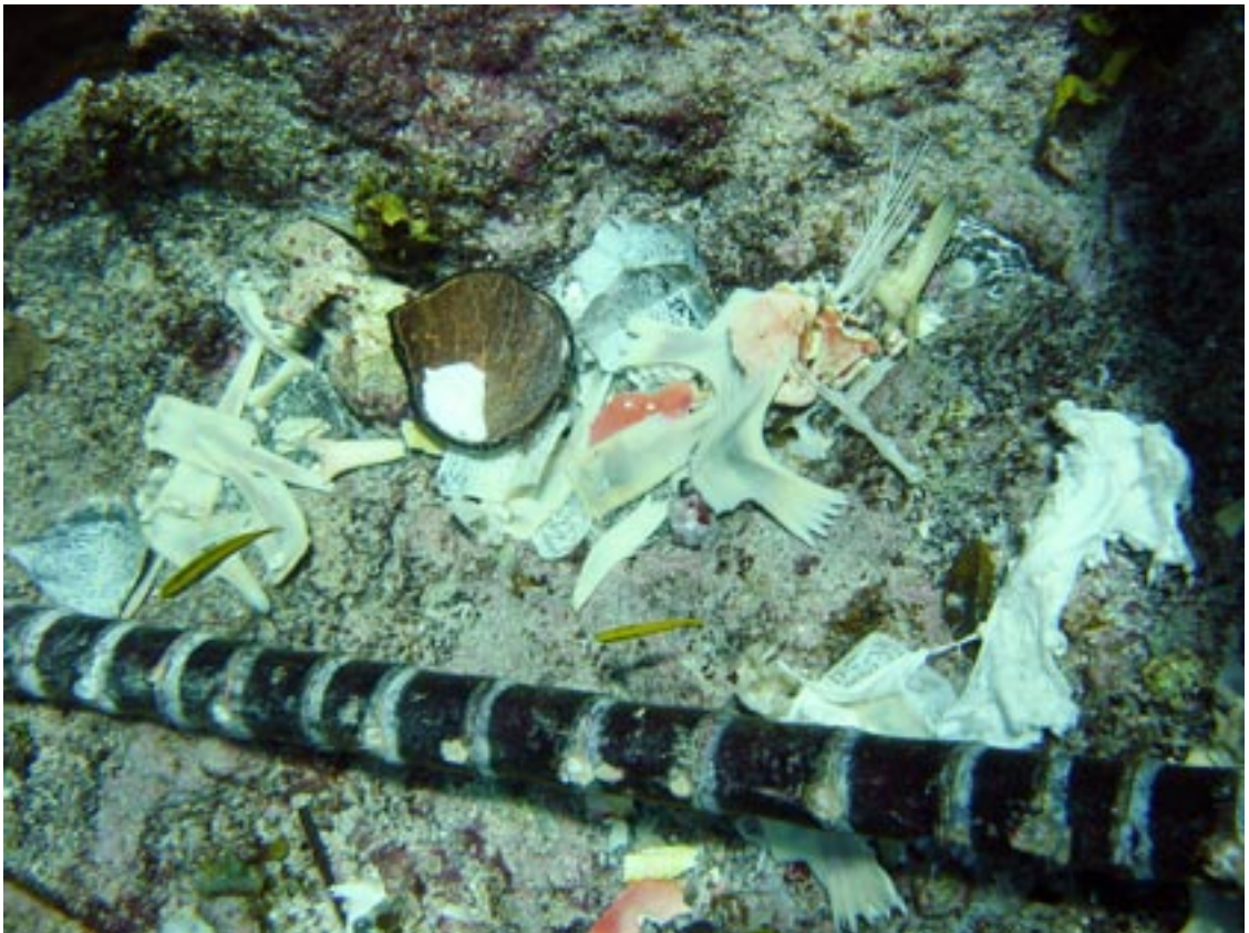
Figure 9.—Underwater refuse pile observed at Lulu Bay containing turtle bones and ventral plates, fish skin, and bamboo.