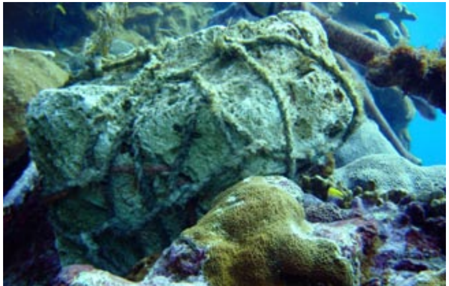
Figure 2.—Rock anchor in Lulu Bay used in temporary mooring system for fishing boats.

A diverse array of taxa appeared in the fishermen’s catch, as observed in their boats and in underwater refuse piles at