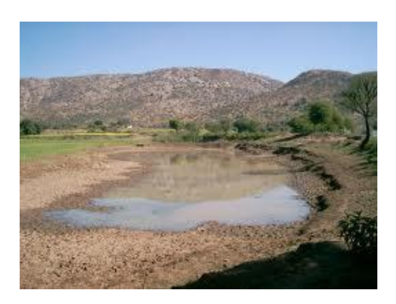
Figure 1. A johad in Rajastan.

The paper begins by providing an overview of debates on natural resources management from the 1950s to present times. The emphasis is on the shift from the engineering paradigm based on the notion of 'big is beautiful', quite popular until the 1970s, to a new-traditionalist (Sinha et al., 1997) discourse which supports the idea of 'small is beautiful', among other issues. Moreover, 'new traditionalism' is often seen in opposition to modernity. I present a critical appraisal of new traditionalism and suggest that it is built on strong rhetoric but weak empirical evidence. I maintain that traditional and modern are not opposing ways of conceiving reality — as is often assumed — but can be