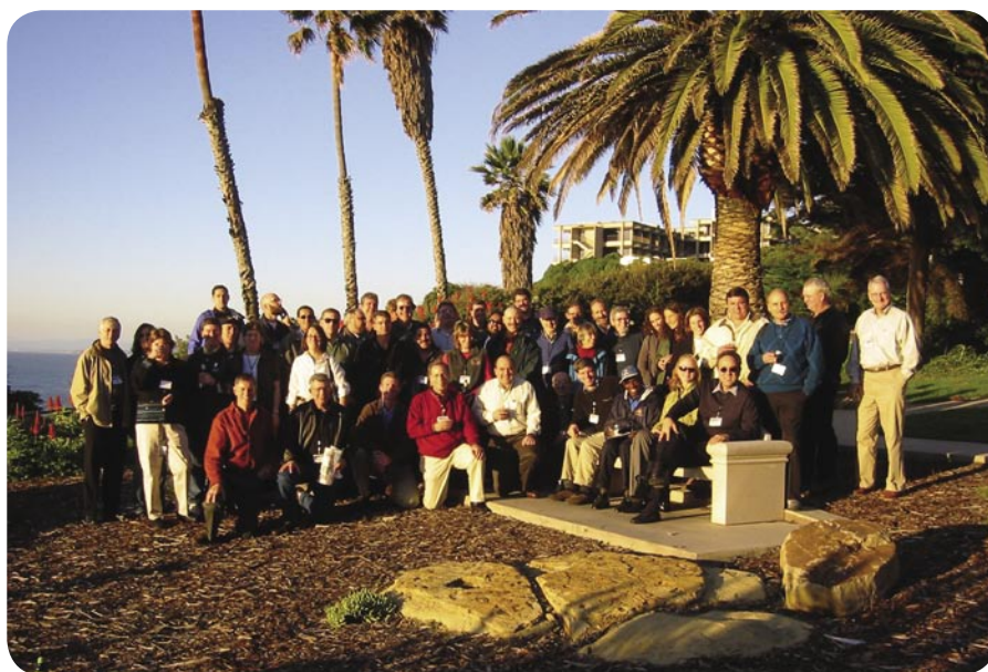
‘Emerging Strategies for Improving Fisheries Management’ attendants, at Scripps Institute, January 12th, 2005.

Rights-based fishing can do that. But it also implies responsibility, and that’s why creating an ocean ethic could be so important. For the most efficient way to fish sustainably is not to have fishermen do it because they’re told to, but rather because they want to.