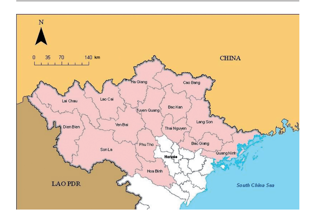
Figure 2: Administrative map of the northern mountain region of Vietnam (it includes the northeast and northwest sub-regions, which appear in pink).

products, first in the lowlands, then in the uplands from 1959. Land with a slope >25 degrees was classified as "forestry land", meaning land for forestry purpose. Forestry land was nationalised and managed by a system of logging companies established by the State, called state forestry enterprises.