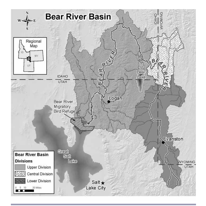
Fig. 1 . The Bear River Basin is divided into three administrative divisions for water management. (Map created by Adrian Welsh).

The right to water in the West is allocated on a first-come, first-served basis under prior appropriation water law. Because the Bear River flows through three states and serves multiple uses and users, additional compacts and settlement agreements were crafted to foster cooperation in the use of water. The Bear River Compact establishes water rights and obligations of Idaho, Utah, and Wyoming and divides the Bear River Basin into three main administrative divisions: Upper Division, Central Division, and Lower Division (Fig. 1). Everyday operation of the Bear River is left to the three states unless there is a water emergency to trigger interstate regulation and invoke the involvement of the interstate Bear River Commission (Jibson 1991, Boyce 1996, Endter-Wada et al. 2009).