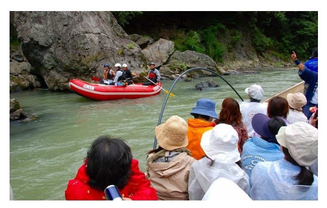
Photo 2 A rafting boat which retreats Hozugawa-kudari boat (June 7th 2009 at Hozu valley)