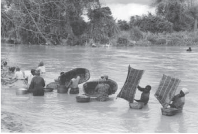
Picture 5. Men are now taking up women's baskets for fishing.

ing sectors, which took away fishing and hunting rights. In the beginning this was a relatively minor problem as fishing in the tributaries was still possible for the Ila and Balundwe, who thus compensated the loss of game meat. Game meat used to be more important than beef, because traditionally the Ila and Balundwe only consumed beef at special occasions, such as funerals. The bulk of meat eaten in olden days was game meat. 18 Also to obtain cash, the Ila used to rarely sell cattle because cattle was seen as a bank of security, used for marriage, milk consumption and for political reasons 19 and ownership of cattle often involved more than just one person. 20