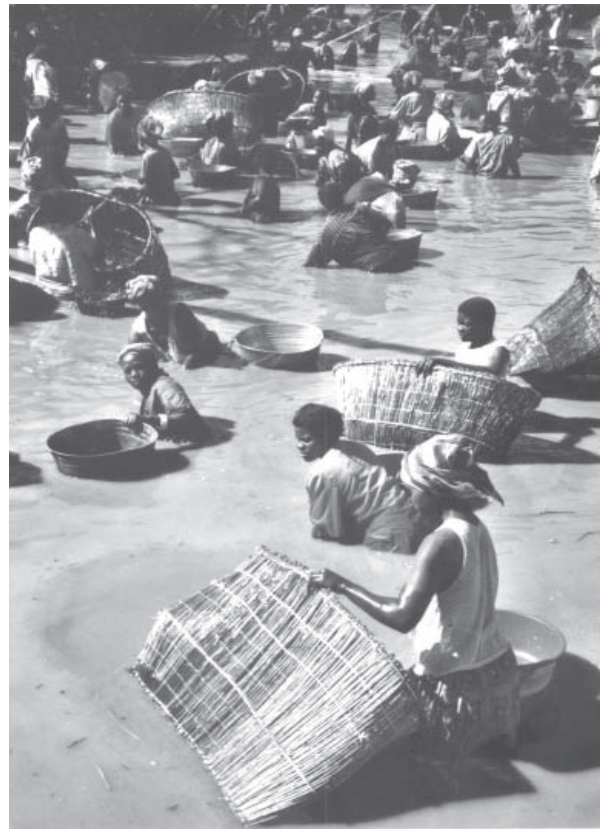
Picture 3. Ila women with baskets at a collective fishing event.

the state. Fisheries officers cannot fulfil their role and local rules are no longer in place.