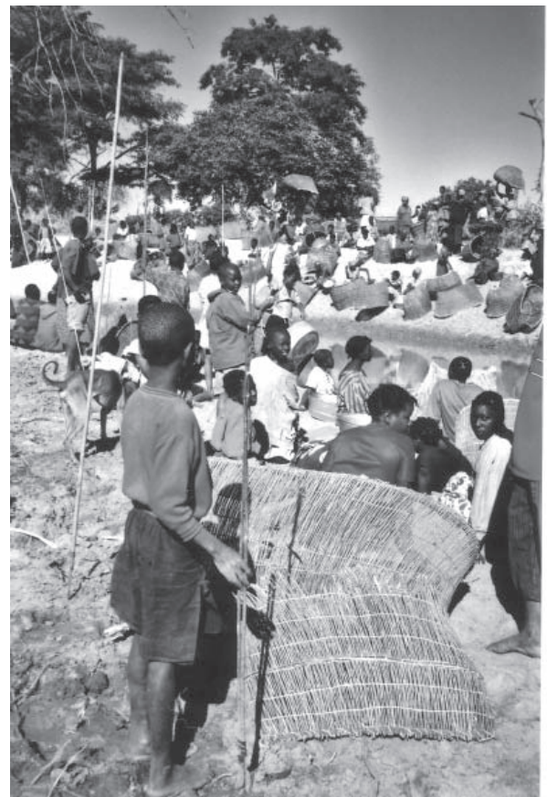
Picture 2. Ila waiting at a pond for the fish monitor ( utamba ) to perform the collective fishing ritual.

when the authorities regarded the Kafue Flats, and especially the fisheries, as "underused". After "pacification" they invited the Lozi, the former enemies of the local people, to step in and use the fish in the area. This step undermined the power of the indigenous Batwa people, who were not numerous enough to take action against these immigrants. 9 The Lozi fishermen installed permanent settlements in the area and introduced new fishing techniques, including nets. In the late 1950s the area attracted many commercial fishermen and traders from all over Zambia, but especially Bemba people from the Copperbelt. As catches went down the state took measures to set up formal fishery institutions by issuing licences, closing times and mini-