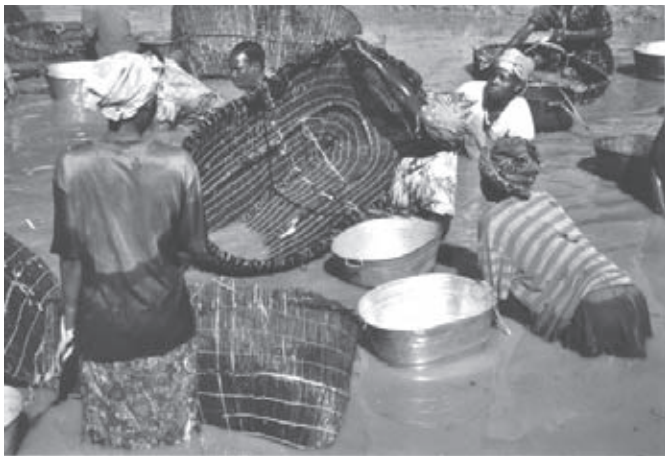
Picture 4. Basket fishing is often a collective event.

restructuring conditions since the time of structural adjustments and the cuts in the state budget, meant that less money is available for wildlife conservation, and underpaid game scouts are weaker in resisting corruption. The government attempted to cope with a partial privatisation of the Zambian Wildlife Authority (ZAWA). It has also revamped a programme called Administrative Management Design for Game Management Areas (ADMADE), already initiated during Kaunda's times, which uses participatory approaches and seeks to involve local communities in Community Resource Boards.