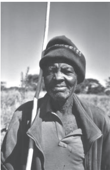
Picture 1. The fishing monitor ( utamba ) of one tributary sector, Chiefdom Nalubamba.

After a promising economic start due to its copper industries, Zambia is today one of the least developed and poorest coun-