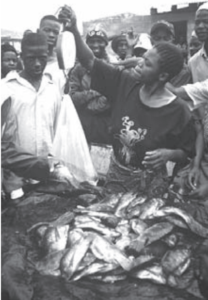
Picture 6. A fishtrader at a Lusaka market