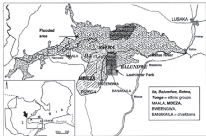
Map 1. the Kafue flats and their inhabitants.

economy is based on cattle but it also includes agriculture and fishing in the tributaries of the Kafue river, ponds and oxbows, as well as individual and collective hunting. These activities made them prosperous, and their wealth attracted powerful groups such as the Lozi from the northwest, who raided the Ila. Despite being defeated several times, the Ila and Balundwe became known as fierce fighters and defenders of their area. 7