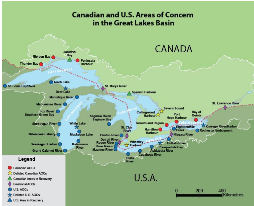
Figure 1: Areas of Concern (AOCs) in the Great Lakes Basin (U.S. EPA, 2019)

Change Canada and the U.S. EPA, to other federal and state agencies, and many local governments, nongovernmental organizations (NGOs), businesses, and independent residents.