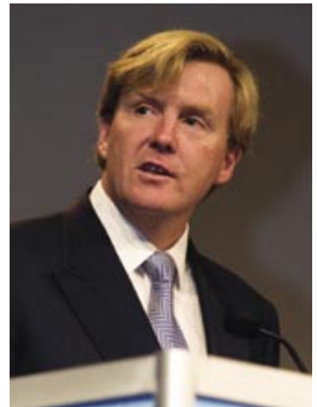
H.R.H. The Prince of Orange

The presentation of the long-anticipated results of the five-year long Comprehensive Assessment of Water Management in Agriculture, and the launch of the anti-corrup-