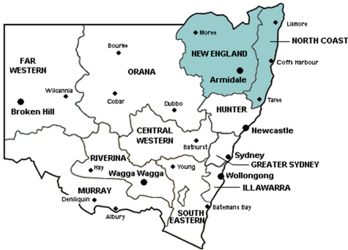
Figure 1. Tilbuster Commons was established close to Armidale, New South Wales, Australia.