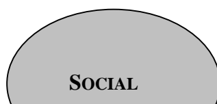
Figure 1. Linkages between the economic, social and environmental dimensions of sustainable agriculture

On the one hand the economic, environmental and social dimensions of sustainable agriculture are complementary and to some extent overlap. A prosperous and economically efficient agriculture sector is able to undertake and invest in environmental friendly practice. It is likely to have the knowledge and incentive (by having the full private property rights) to maintain its resource base, so ensuring that it remains prosperous. An economically efficient sector will be getting the most from the available resources, with prices of agricultural production reflecting their costs of production, which contributes to keeping food prices low. Environmentally friendly production and low prices for agricultural products are positive for the social dimension. Ensuring a clean environment and a varied wildlife, a beautiful and valuable landscape and other rural amenities also enhances social welfare.