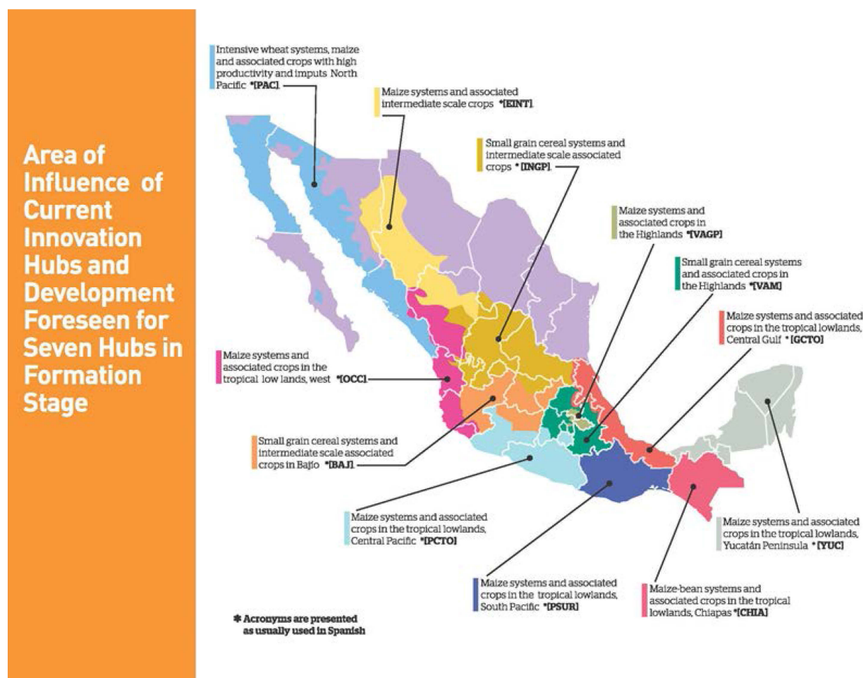
Figure 1: Regions of Mexico where MasAgro is working