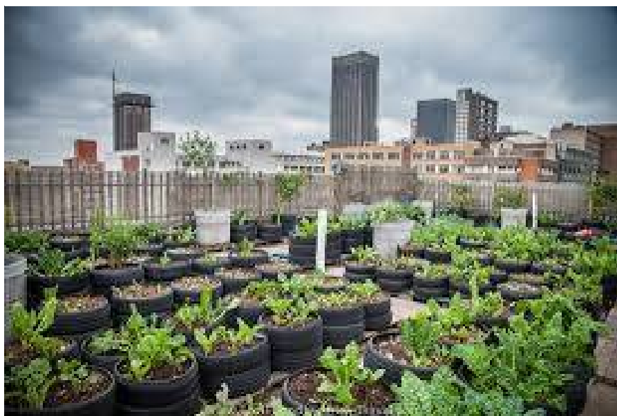
Plate 1: Medium-scale vegetable garden in Abuja city, Nigeria

Research data from across the globe seem to indicate that intra-urban agriculture tends to be relatively small-scale and more subsistence-oriented than peri-urban agriculture, although exceptions can regularly be found (e.g., vegetable production and production of mushroom or ornamental plants). Intra-urban agriculture takes place within inner cities. The truth remains that no matter how advanced a location is, most cities and towns have vacant and under-utilized land areas that are or can be used for urban agriculture including areas not suited for building (along streams, close to airports, etc.), public or private lands not being optimally used (lands waiting for construction) that are on interim use among others.