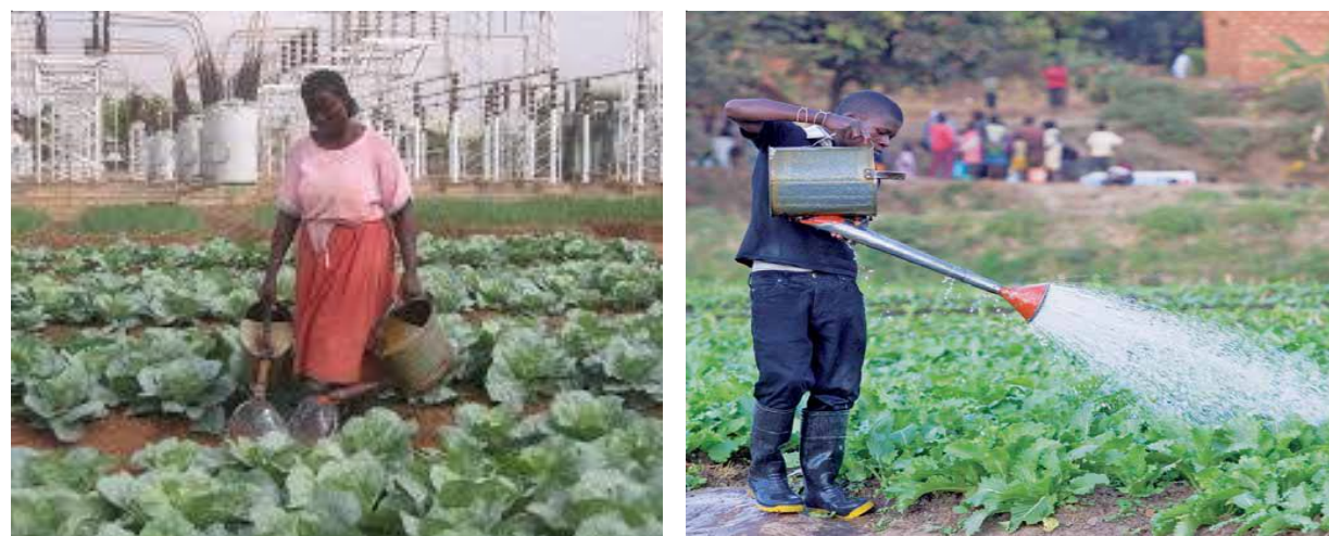
Plate 2: Urban dwellers carrying agricultural operations on their small farm land in Lagos Nigeria

Vietnam seem to indicate that farm enterprises located in the fringe of the city are on average larger than those in the city centers and more strongly market-oriented. Urban agriculture is being developed as a means of reducing seasonal gaps perennially experienced in fresh food budget for urban dwellers. There are surmountable challenges in practicing urban agriculture.