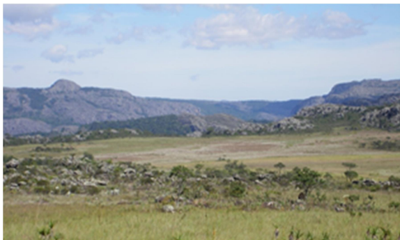
Photo 01: Native altitude fields where there is grazing of animals and collection (Source:Monteiro, F.T., 2018).

In general, the families stay on the mountains during long days in the altitude fields, during the dry season (drought), for the collection of sempre-viva flowers and for the management of rustic cattle and pack animals. They usually lodge on "ranchos," as defined by constructions generally made of raw materials found therein, such as wood and native palm leaf. It is also common to inhabit the "lapas" (as caves are defined in the rock formations), using mattresses made with grasses native to the mountains. Some caves, even, receive the names of the families that traditionally settled there for the collection of flowers, an activity that can recruit all the members of the same family. These moments allow meetings, parties and links between families from different communities.