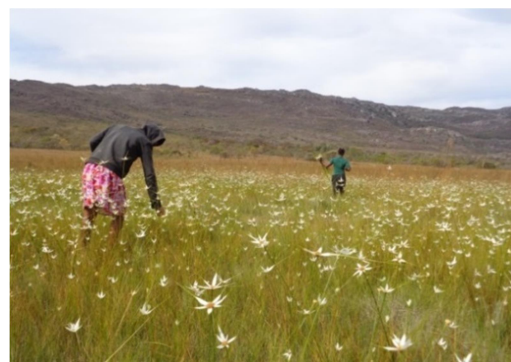
Photo 04: Collecting flowers in communal lands (Source:Monteiro, F.T., 2018).