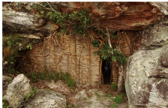
Photo 02: "Lapa" of housing during collection.