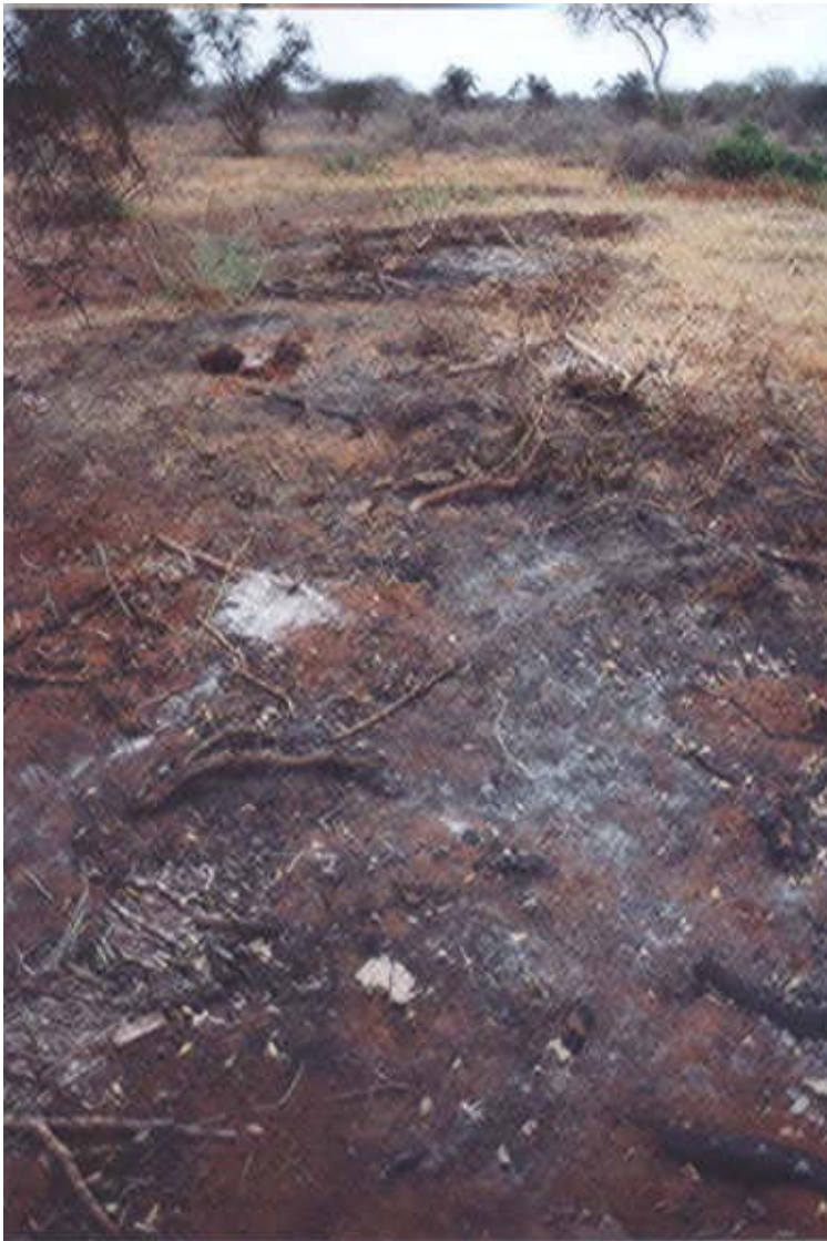
Maasai burned huts within the conservation area

character who often expressed his dislike of the Maasai and their cattle. He was once heard to have said “ I do not like cattle in the conservation area – actually I hate cattle ”. He chased away the Maasai and warned them to stay out. Complaints and anger among the Maasai rose. The central issue in the quarrel over the use of the dry season grazing cum conservation area was the fact that the Group Ranch Committee, without consulting all the members of the group ranch, had granted permission to Porini to subdivide the 16 hectares thought to be used for the building of the lodge in four pieces of 10 acres each. The tour operator thereupon chose to develop the four corners of the Conservation Area. Selengei members not aware of this arrangement and not knowing they were prohibited from building temporary shelters had constructed huts during the very dry period of early 1999. 15 The project manager became outraged and set fire to these huts. The Maasai in turn became furious and some warriors, mobilised by the Conservation Committee, invaded the sanctuary and threatened to set fire on the manager’s camp in retaliation. They did not implement this threat but insisted the manager had to leave the area. They stated that the burning of huts was to be expected from somebody who hated cattle. After the manager was chased they also removed the Conservation Area signboard at the northwest side of the sanctuary.