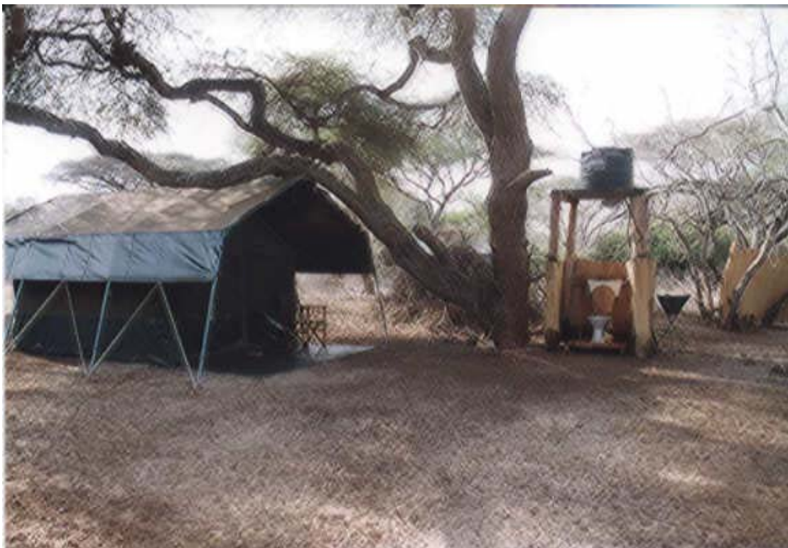
The luxurious tented camp and flush toilet

As a result of the burning incident quarrels among the Maasai group ranch members increased. The Group Ranch Committee was accused of not informing and consulting all Selengei members. The person holding the position of the Porini liaison officer was particularly contested. Tropical Places was requested to replace him. Clan politics in combination with national politics played a crucial role in this strategy. The local Member of Parliament, belonging to the opposition party Democratic Party of Kenya, was invited to reconcile and explain that land would remain in the hands of the Maasai.