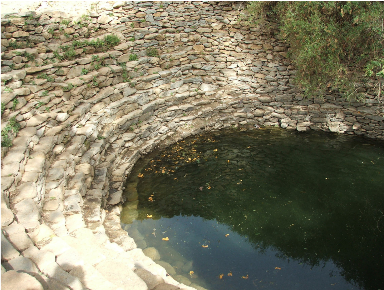
Traditional stone-lined artesian well, Ethiopia (Photo Credit: Matthew McCartney, IWMI).

Rainfall variability is an important factor in development and translates directly into a need for water storage. In Africa, and to a lesser extent Asia, existing variability and insufficient capacity to manage it, lies behind much of the prevailing poverty and food insecurity. These continents are predicted to experience the greatest negative impacts of climate change. By making water available at times when it would not normally be available, water storage can significantly increase agricultural and economic productivity and enhance the well-being of people.