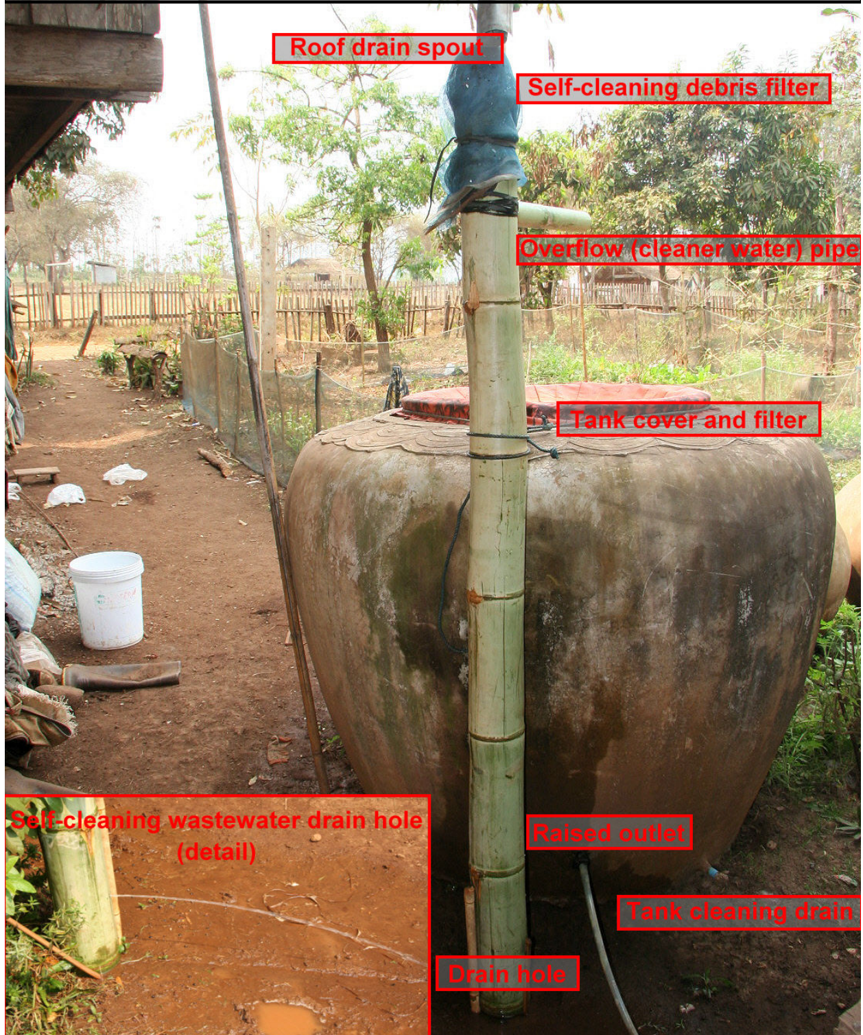
Figure 1. The schematic of the Potable Rain Maker prototype (Laos)