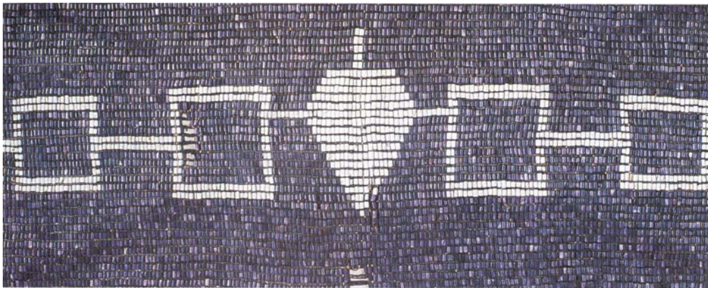
The 'Hiawatha Wampum belt' symbolised the founding of the Five (later Six) Nations Confederacy

The interactions between the French and the Algonquians were far from perfect. Disputes often arose, notably over the traders' relations with Indian women, specific exchanges, debts, and personal violence, frequently fuelled by the cheap liquor which was an integral part of the trade. An essential element of the Middle Ground was thus the mutual acceptance of means of dispute settlement. The French system of justice, in which retribution for crimes required that individual criminals be punished by the State, fitted ill with the indigenous notion that misdemeanours should be paid for by the group, which had collective responsibility for them. In the Middle Ground, the French acceded to the indigenous notion of collective payment for crimes, while the Algonquians accepted that, for the French to feel that justice had been done, individual perpetrators had to be seen to be punished. With honour satisfied on both sides, disputes could be resolved without recourse to warfare. 12